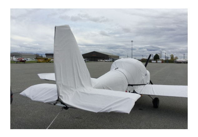
Evektor Sportstar Full Cover Set