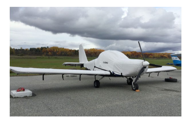
Evektor Sportstar Full Cover Set

shorter useful life if used continuously outside than the all-year use material.