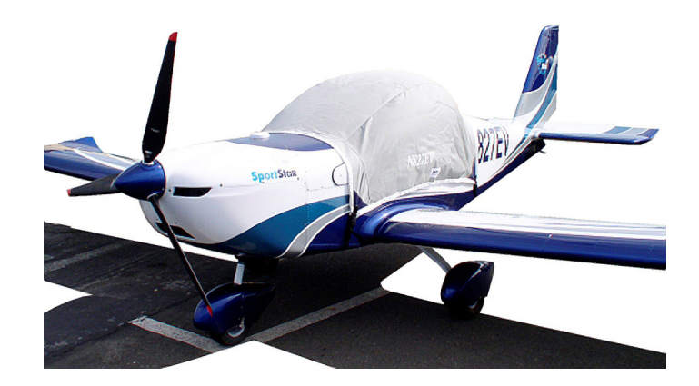
Evektor Sportstar Standard Canopy Cover

This cover type is made from Silver Acrylic Sunbrella canvas and is 100% lined with a soft and smooth microfiber. Bruce's Custom Covers developed this material combination especially for aircraft protection. The outer material is medium weight and treated for water resistance, UV resistance and anti-static buildup. The inner lining is a very soft and smooth microfiber to prevent scratching. The material is very reflective, and tests show that the cabin interior temperature can be reduced to near-ambient temperature on the hottest of days. It is water, ice and snow repellent, yet breathable to allow moisture to escape from between the cover and the aircraft surface.