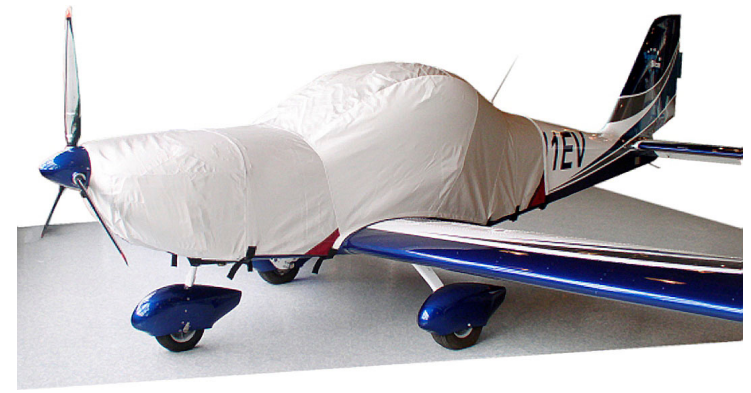
Evektor Sportstar Extended Canopy/Engine Cover