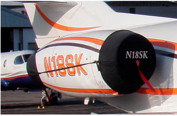
Falcon Jet Engine Intake/Exhaust Cover Set