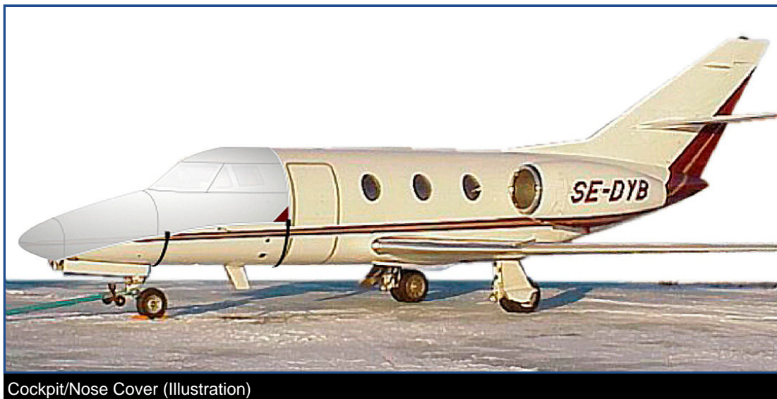
Cockpit/Nose Cover (Illustration)