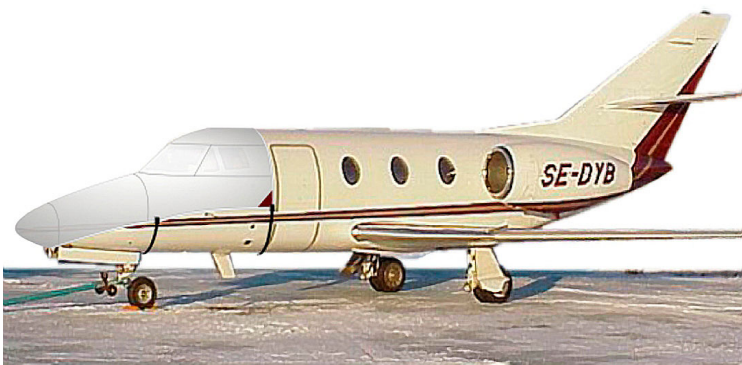
Cockpit/Nose Cover (Illustration)