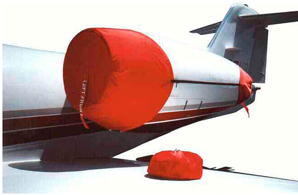
Lear 30 Tri-Fold Engine Cover