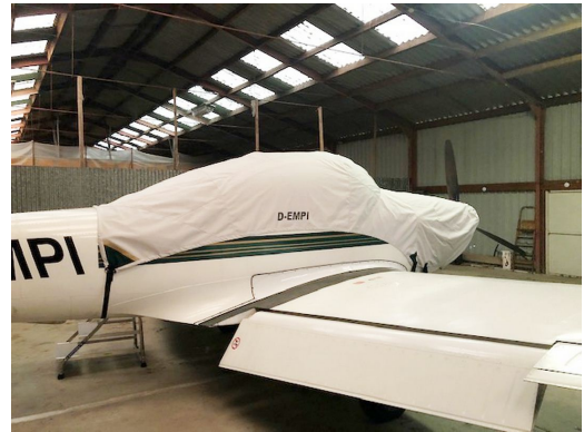
Piaggio FW-149D Canopy/Engine Cover