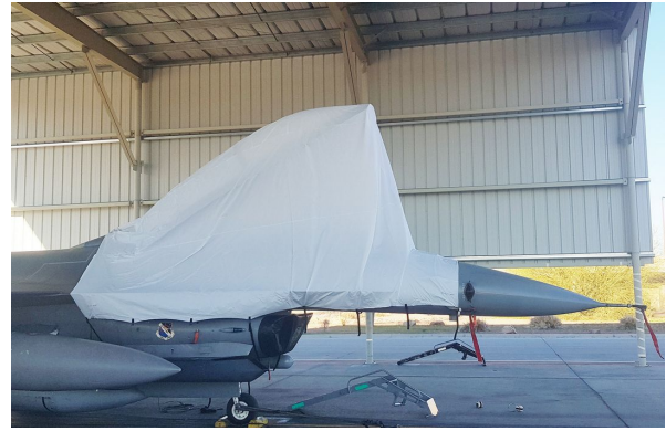
McDonnell Douglas F16-D Canopy Cover, open cockpit type (test fit cover)