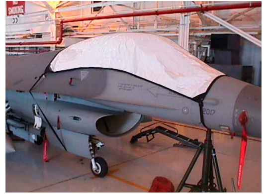
F-16 "Blackout" type Canopy Cover