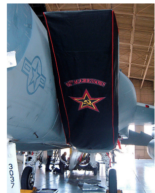
F15 Intake Cover