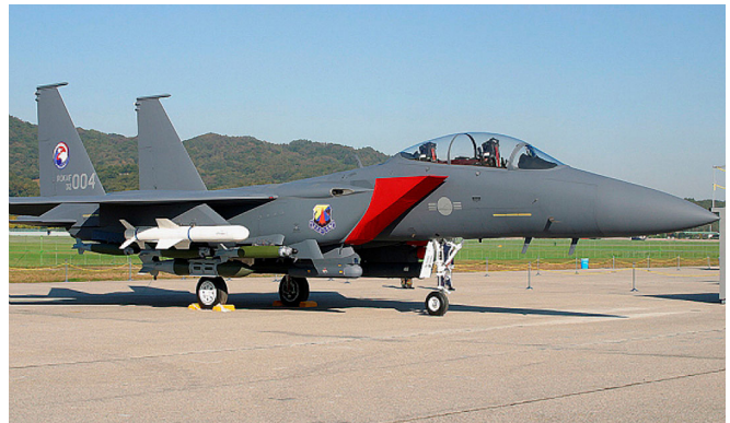
Intake Cover, F15-K