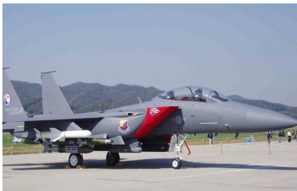
McDonnell Douglas F-15 Eagle Engine Inlet Covers

The McDonnell Douglas F-15 Eagle Intake Covers are designed to install easily yet be completely storable. A spring steel hoop is sewn into the hem of each cover, allowing them to be installed without climbing onto the wing or using a stepladder. To store the covers the spring steel hoop folds like a band-saw blade into three nesting rings. Each cover folds into a compact circular bundle which is stored in the included duffle bag, yet they unfold quickly for use. The Tri-Fold Ring cover is made of medium weight nylon which is available in a variety of colors to match the paint trim. Each cover set comes complete with installation and folding instructions. The aircraft's registration number can be silkscreened onto the cover for an extra charge.