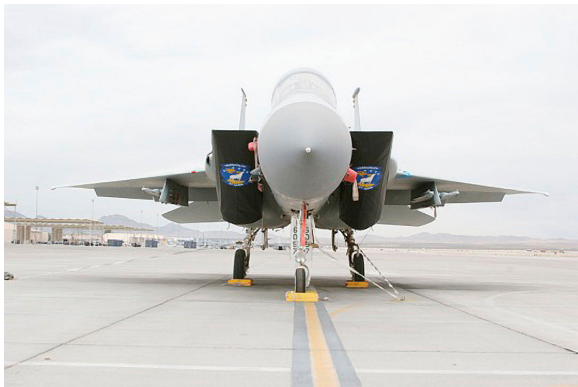
McDonnell-Douglas F-15 Intake Covers

The McDonnell Douglas F-15 Eagle Intake Covers are designed to install easily yet be completely storable. A spring steel hoop is sewn into the hem of each cover, allowing them to be installed without climbing onto the wing or using a stepladder. To store the covers the spring steel hoop folds like a band-saw blade into three nesting rings. Each cover folds into a compact circular bundle which is stored in the included duffle bag, yet they unfold quickly for use. The Tri-Fold Ring cover is made of medium weight nylon which is available in a variety of colors to match the paint trim. Each cover set comes complete with installation and folding instructions. The aircraft's registration number can be silkscreened onto the cover for an extra charge.