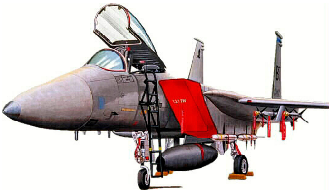
F15 Cockpit HeatShields & Inlet Cover

The McDonnell Douglas F-15 Eagle Intake Covers are designed to install easily yet be completely storable. A spring steel hoop is sewn into the hem of each cover, allowing them to be installed without climbing onto the wing or using a stepladder. To store the covers the spring steel hoop folds like a band-saw blade into three nesting rings. Each cover folds into a compact circular bundle which is stored in the included duffel bag, yet they unfold quickly for use. The Tri-Fold Ring cover is made of medium weight nylon which is available in a variety of colors to match the paint trim. Each cover set comes complete with installation and folding instructions. The aircraft's registration number can be silkscreened onto the cover for an extra charge.