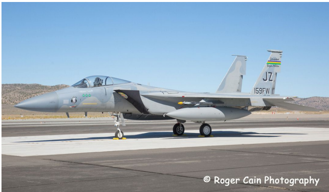
McDonnell-Douglas F-15 Intake Covers

The McDonnell Douglas F-15 Eagle Intake Covers are designed to install easily yet be completely storable. A spring steel hoop is sewn into the hem of each cover, allowing them to be installed without climbing onto the wing or using a stepladder. To store the covers the spring steel hoop folds like a band-saw blade into three nesting rings. Each cover folds into a compact circular bundle which is stored in the included duffle bag, yet they unfold quickly for use. The Tri-Fold Ring cover is made of medium weight nylon which is available in a variety of colors to match the paint trim. Each cover set comes complete with installation and folding instructions. The aircraft's registration number can be silkscreened onto the cover for an extra charge.