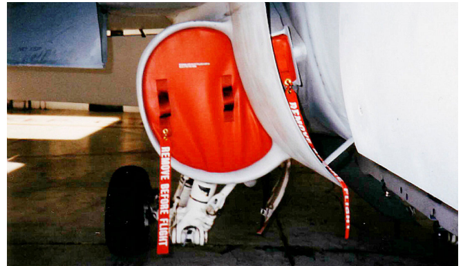
Engine & ECS Inlet Plugs