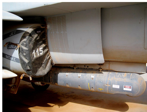
F-18 Intake Covers