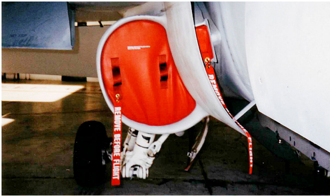
Engine & ECS Inlet Plugs

The Engine Inlet Plugs are custom fit for your McDonnell Douglas F-18 Hornet, Super Hornet intakes, made with heavy-duty vinyl material, and stuffed with a single block of sculpted urethane foam. Each plug has a zipper that allows the foam to be removed and dried if necessary. Engine plugs have 'remove before flight' streamers sewn onto the face of the plugs. Most plugs are imprinted with the aircraft registration number in black for an extra charge. Storage bag NOT included. Engine plugs may be inserted after flight when the engine is still warm. Engine Inlet Plugs are commonly referred to as Cowl Plugs, Intake Plugs, Cowl Blocks, Engine Blocks, and Engine Bungs.