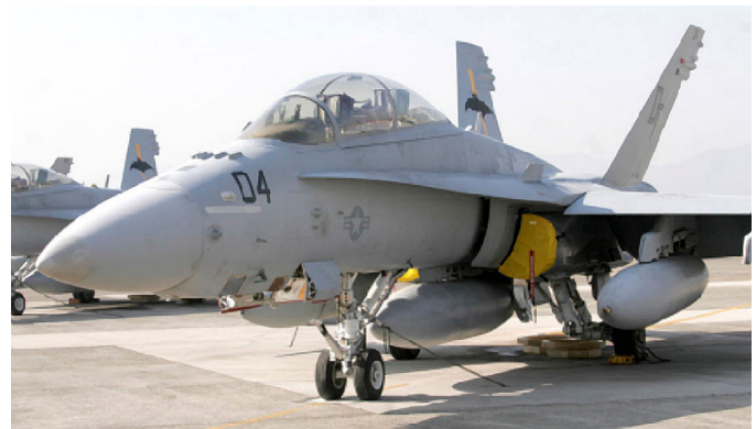
F-18 Intake Cover Set