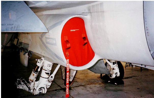
Engine Inlet Plug

The Engine Inlet Plugs are custom fit for your McDonnell Douglas F-18 Hornet, Super Hornet intakes, made with heavy-duty vinyl material, and stuffed with a single block of sculpted urethane foam. Each plug has a zipper that allows the foam to be removed and dried if necessary. Engine plugs have 'remove before flight' streamers sewn onto the face of the plugs. Most plugs are imprinted with the aircraft registration number in black for an extra charge. Storage bag NOT included. Engine plugs may be inserted after flight when the engine is still warm. Engine Inlet Plugs are commonly referred to as Cowl Plugs, Intake Plugs, Cowl Blocks, Engine Blocks, and Engine Bungs.