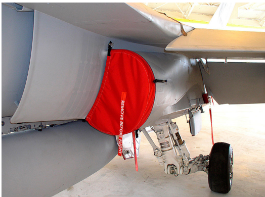
F-18 Engine Inlet Cover

The McDonnell Douglas F-18 Hornet, Super Hornet Intake Covers are designed to install easily yet be completely storable. A spring steel hoop is sewn into the hem of each cover, allowing them to be installed without climbing onto the wing or using a stepladder. To store the covers the spring steel hoop folds like a band-saw blade into three nesting rings. Each cover folds into a compact circular bundle which is stored in the included duffle bag, yet they unfold quickly for use. The Tri-Fold Ring cover is made of medium weight nylon which is available in a variety of colors to match the paint trim. Each cover set comes complete with installation and folding instructions. The aircraft's registration number can be silkscreened onto the cover for an extra charge.