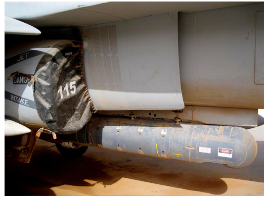
F-18 Intake Covers