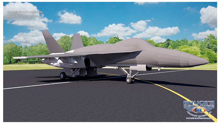
F-18 Storage Covers, 3D rendering