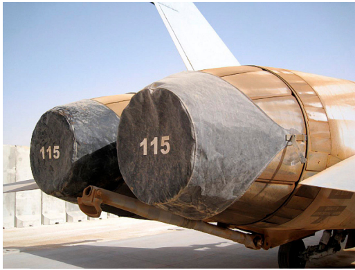
F-18 Exhaust Covers

The McDonnell Douglas F-18 Hornet, Super Hornet Intake Covers are designed to install easily yet be completely storable. A spring steel hoop is sewn into the hem of each cover, allowing them to be installed without climbing onto the wing or using a stepladder. To store the covers the spring steel hoop folds like a band-saw blade into three nesting rings. Each cover folds into a compact circular bundle which is stored in the included duffle bag, yet they unfold quickly for use. The Tri-Fold Ring cover is made of medium weight nylon which is available in a variety of colors to match the paint trim. Each cover set comes complete with installation and folding instructions. The aircraft's registration number can be silkscreened onto the cover for an extra charge.