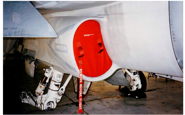
Engine Inlet Plug