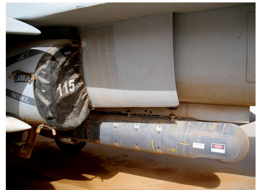
F-18 Intake Covers