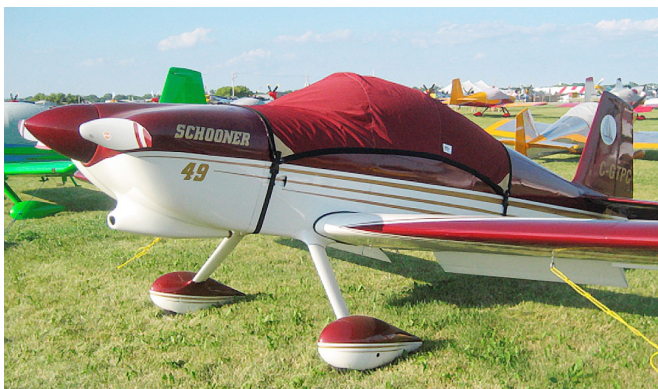
F1 Rocket Canopy Cover

This cover type is made from Silver Acrylic Sunbrella canvas and is 100% lined with a soft and smooth microfiber. Bruce's Custom Covers developed this material combination especially for aircraft protection. The outer material is medium weight and treated for water resistance, UV resistance and anti-static buildup. The inner lining is a very soft and smooth microfiber to prevent scratching. The material is very reflective, and tests show that the cabin interior temperature can be reduced to near-ambient temperature on the hottest of days. It is water, ice and snow repellent, yet breathable to allow moisture to escape from between the cover and the aircraft surface.