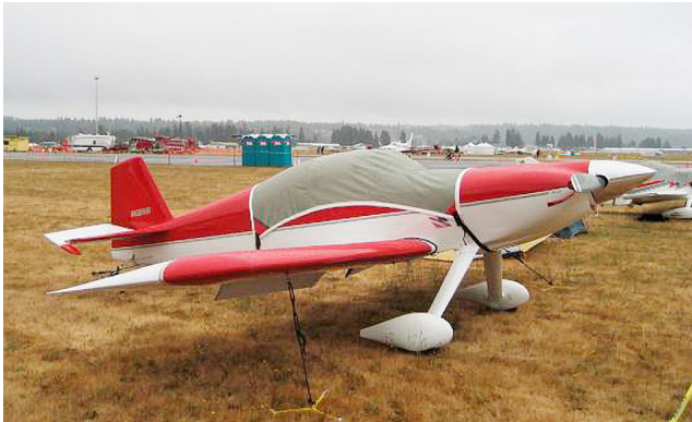
Harmon Rocket Canopy Cover & Engine Inlet Plugs

Travel Covers are made with Silver Solution-Dyed Polyester fabric and only lined over the windshield to save weight. The material is lightweight and more compact for easy stowage in the aircraft. The polyester material is water resistant, but only intended for occasional use outside. We also have an ultra lightweight material available for fitted hangar dust covers. For daily outdoor use, the non-travel Sunbrella Cover is the best choice.