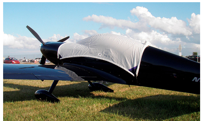
F1 Rocket Canopy Cover