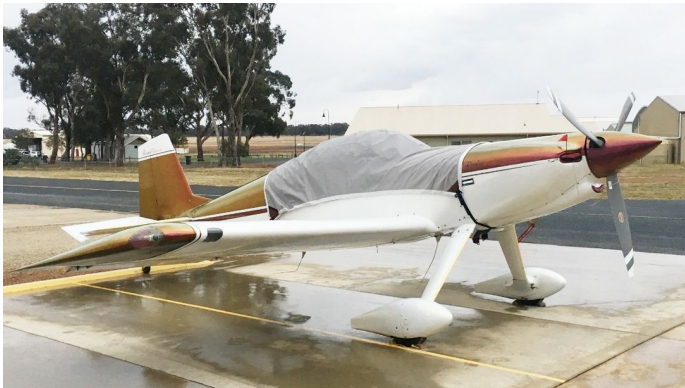
F1 Rocket Engine Plugs too small to imprint on plugs F1 Rocket Travel Cover, Light Weight Travel Canopy Cover, Bubble Windshield, Engine Plugs