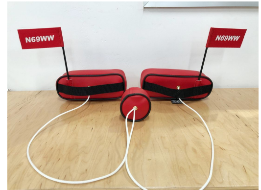
F1 Rocket Engine Plugs too small to imprint on plugs