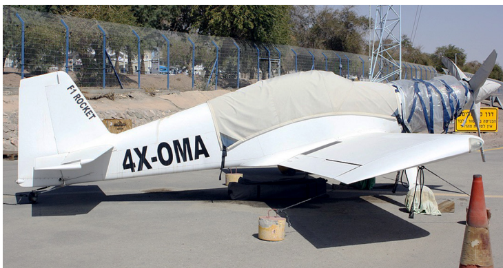
You should always cover your plane.

This cover type is made from Silver Acrylic Sunbrella canvas and is 100% lined with a soft and smooth microfiber. Bruce's Custom Covers developed this material combination especially for aircraft protection. The outer material is medium weight and treated for water resistance, UV resistance and anti-static buildup. The inner lining is a very soft and smooth microfiber to prevent scratching. The material is very reflective, and tests show that the cabin interior temperature can be reduced to near-ambient temperature on the hottest of days. It is water, ice and snow repellent, yet breathable to allow moisture to escape from between the cover and the aircraft surface.