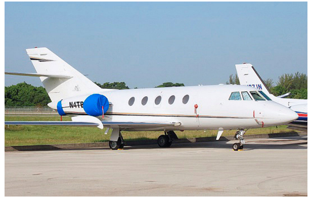
Falcon Engine Cover & Cockpit HeatShields