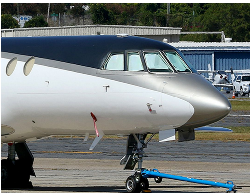
Dassault Falcon 50 Cockpit HeatShields

Cockpit Heatshields are interior sunshades for the aircraft's cockpit. The product is a unique composite of closed-cell foam with a silver mylar finish. The semi-rigid design is stiff enough to stand inside the window framing. The set folds up flat and is easily stored in the included storage sleeve. Some designs may require velcro and suction cups. Our Heatshields for jets are offered white side out because some aircraft manufacturers have issued advisories against reflective window inserts due to potential heat damage. A Heatshield is an excellent short-term remedy for cockpit overheating, but an external fabric cover is more effective for long-term protection.