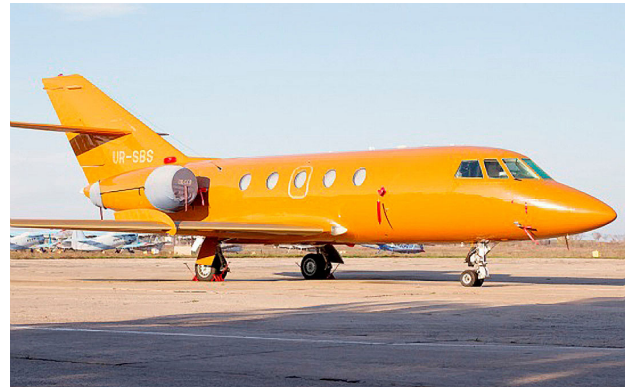
Falcon Engine Covers