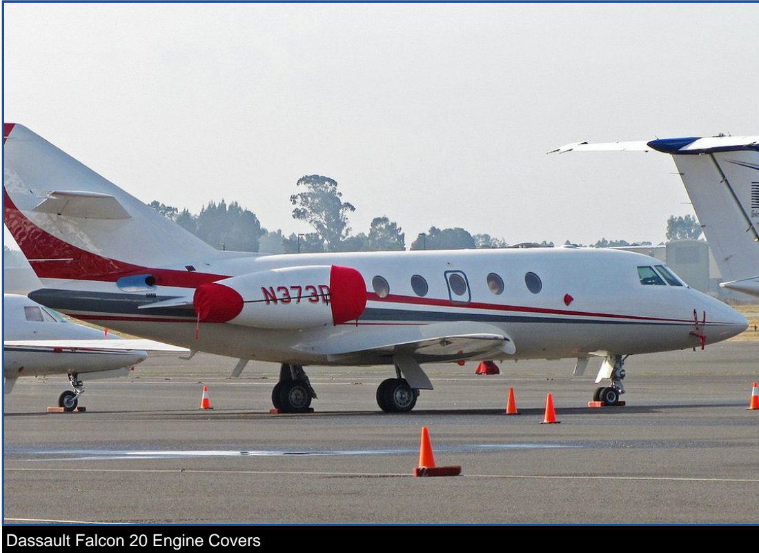
Dassault Falcon 20 Engine Covers