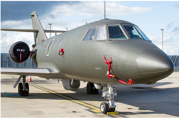
Falcon Engine Covers (not our probe covers)

The Falcon Jet 20 (HU-25) Bikini Style Engine Covers are a single-piece design using a soft and smooth stretchy and fabric. The cover stretches tightly over both the intake and exhaust, installing quickly and easily. These covers are designed to be used as hangar dust covers and have a useful life of approximately one year.