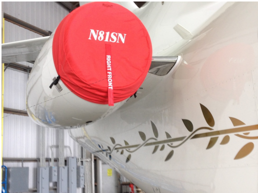
Falcon 900EX Intake Cover

The Falcon Jet 200 (20H) Intake Covers are designed to install easily yet be completely storable. A spring steel hoop is sewn into the hem of each cover, allowing them to be installed without climbing onto the wing or using a stepladder. To store the covers the spring steel hoop folds like a band-saw blade into three nesting rings. Each cover folds into a compact circular bundle which is stored in the included duffle bag, yet they unfold quickly for use. The Tri-Fold Ring cover is made of medium weight nylon which is available in a variety of colors to match the paint trim. Each cover set comes complete with installation and folding instructions. The aircraft's registration number can be silkscreened onto the cover for an extra charge.