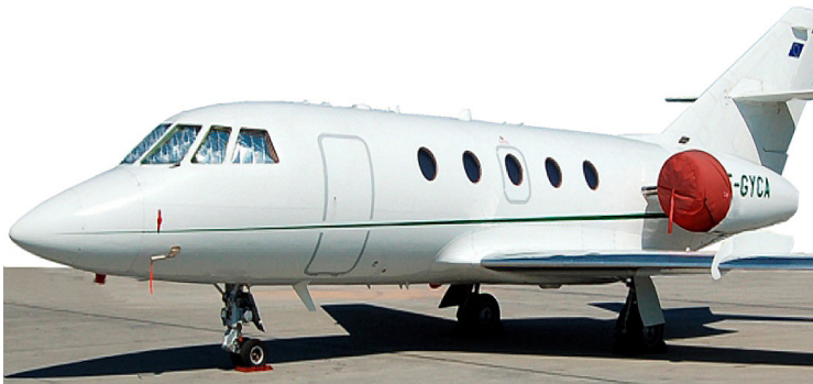
Falcon Engine Cover & Cockpit HeatShields

The Falcon Jet 200 (20H) Intake Covers are designed to install easily yet be completely storable. A spring steel hoop is sewn into the hem of each cover, allowing them to be installed without climbing onto the wing or using a stepladder. To store the covers the spring steel hoop folds like a band-saw blade into three nesting rings. Each cover folds into a compact circular bundle which is stored in the included duffle bag, yet they unfold quickly for use. The Tri-Fold Ring cover is made of medium weight nylon which is available in a variety of colors to match the paint trim. Each cover set comes complete with installation and folding instructions. The aircraft's registration number can be silkscreened onto the cover for an extra charge.