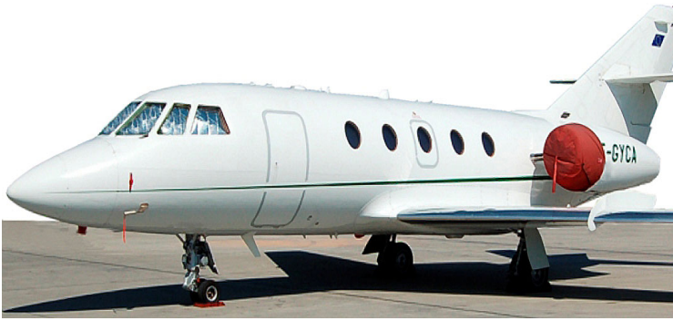
Falcon Engine Cover & Cockpit HeatShields