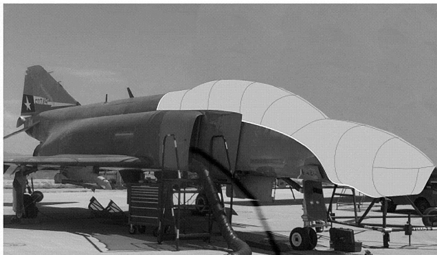
F4 Phantom Canopy/Nose Cover

This cover type is made from Silver Acrylic Sunbrella canvas and is 100% lined with a soft and smooth microfiber. Bruce's Custom Covers developed this material combination especially for aircraft protection. The outer material is medium weight and treated for water resistance, UV resistance and anti-static buildup. The inner lining is a very soft and smooth microfiber to prevent scratching. The material is very reflective, and tests show that the cabin interior temperature can be reduced to near-ambient temperature on the hottest of days. It is water, ice and snow repellent, yet breathable to allow moisture to escape from between the cover and the aircraft surface.