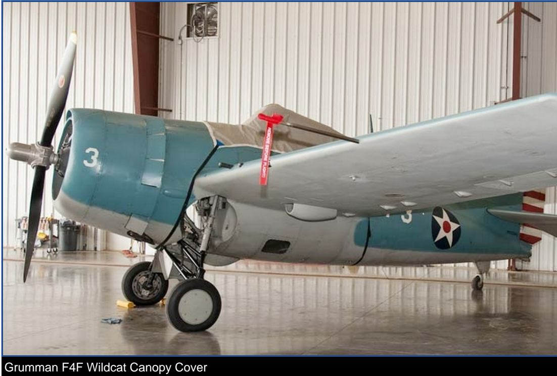
Grumman F4F Wildcat Canopy Cover