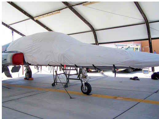
Northrup F5 Talon Canopy Cover

This cover type is made from Silver Acrylic Sunbrella canvas and is 100% lined with a soft and smooth microfiber. Bruce's Custom Covers developed this material combination especially for aircraft protection. The outer material is medium weight and treated for water resistance, UV resistance and anti-static buildup. The inner lining is a very soft and smooth microfiber to prevent scratching. The material is very reflective, and tests show that the cabin interior temperature can be reduced to near-ambient temperature on the hottest of days. It is water, ice and snow repellent, yet breathable to allow moisture to escape from between the cover and the aircraft surface.