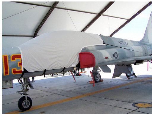
Northrup F5 Talon Canopy Cover