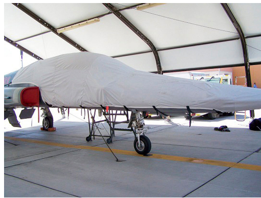
Northrop F5 Talon Canopy Cover