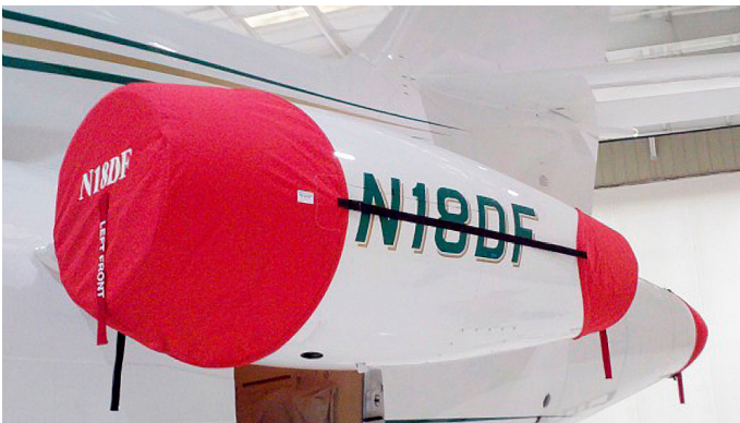
Falcon 900 Engine Cover Set

The Falcon Jet 50EX Bikini Style Engine Covers are a single-piece design using a soft and smooth stretchy and fabric. The cover stretches tightly over both the intake and exhaust, installing quickly and easily. These covers are designed to be used as hangar dust covers and have a useful life of approximately one year.