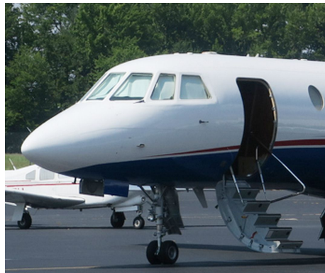
Dassault Falcon 50 Cockpit HeatShields