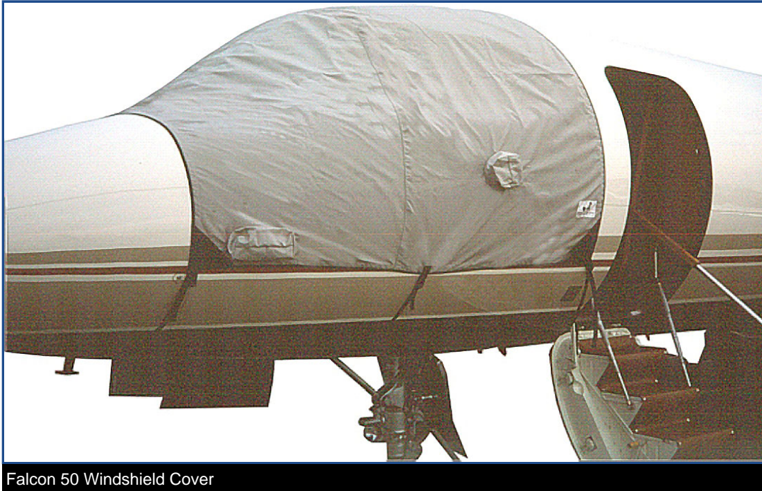
Falcon 50 Windshield Cover