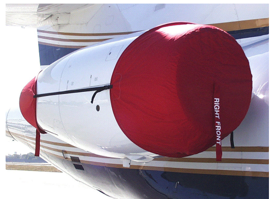
Falcon 50EX Outboard Intake/Exhaust Covers