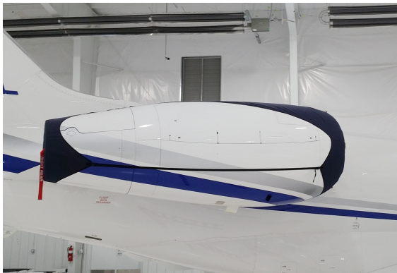
Challenger 300 Intake/Exhaust Cover Set, 3-strap type

The Falcon Jet 6X Bikini Style Engine Covers are a single-piece design using a soft and smooth stretchy and fabric. The cover stretches tightly over both the intake and exhaust, installing quickly and easily. These covers are designed to be used as hangar dust covers and have a useful life of approximately one year.