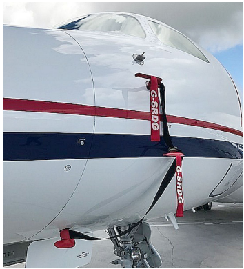
Falcon Jet 7X Pitot Probe/Aoa Set, Heat Resistant Type

The Engine Inlet Plugs are custom fit for your Falcon Jet 6X intakes, made with heavy-duty vinyl material, and stuffed with a single block of sculpted urethane foam. Each plug has a zipper that allows the foam to be removed and dried if necessary. Engine plugs have 'remove before flight' streamers sewn onto the face of the plugs. Most plugs are imprinted with the aircraft registration number in black for an extra charge. Storage bag NOT included. Engine plugs may be inserted after flight when the engine is still warm. Engine Inlet Plugs are commonly referred to as Cowl Plugs, Intake Plugs, Cowl Blocks, Engine Blocks, and Engine Bungs.