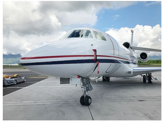
Falcon Jet 7X Pitot Probe/Aoa Set, Heat Resistant Type