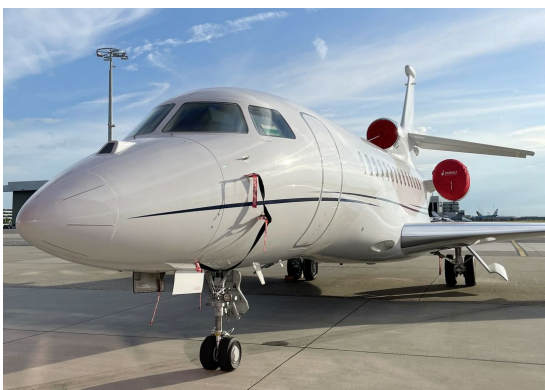
Falcon 7X Engine Cover Set, Pitot Covers

The Engine Inlet Plugs are custom fit for your Falcon Jet 7X intakes, made with heavy-duty vinyl material, and stuffed with a single block of sculpted urethane foam. Each plug has a zipper that allows the foam to be removed and dried if necessary. Engine plugs have 'remove before flight' streamers sewn onto the face of the plugs. Most plugs are imprinted with the aircraft registration number in black for an extra charge. Storage bag NOT included. Engine plugs may be inserted after flight when the engine is still warm. Engine Inlet Plugs are commonly referred to as Cowl Plugs, Intake Plugs, Cowl Blocks, Engine Blocks, and Engine Bungs.