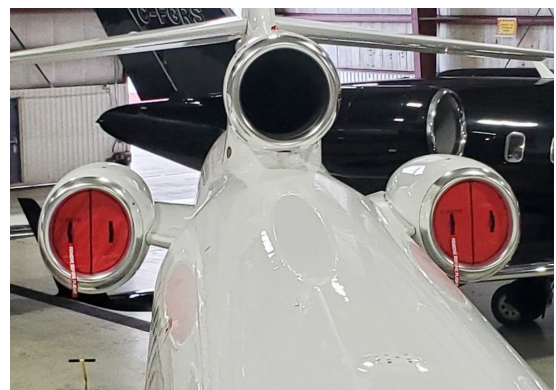
Falcon F7X Outboard Intake Plugs