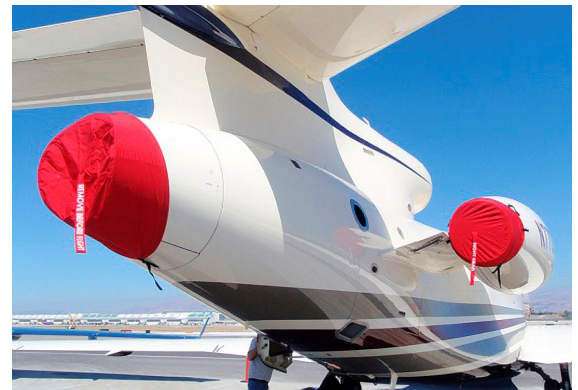
Falcon 7X Exhaust Covers