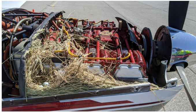
ENGINE PLUGS PREVENT BIRD NEST FOD. Piper Saratoga Engine Cowling Bird's Nest

Engine Inlet Plugs are custom fit for your Grumman F8F Bearcat intakes, made with heavy-duty vinyl material, and stuffed with a single block of sculpted urethane foam. Each plug has a zipper that allows the foam to be removed and dried if necessary. Engine plugs have warning flags that are visible from the cockpit or 'remove before flight' streamers sewn onto the face of the plugs. Most plugs are imprinted with the aircraft registration number in black for an extra charge. Storage bag NOT included. Engine plugs may be inserted after flight when the engine is still warm. Engine Inlet Plugs are commonly referred to as Cowl Plugs, Intake Plugs, Cowl Blocks, Engine Blocks, and Engine Bungs.