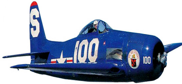
Covers for the Grumman F8F Bearcat