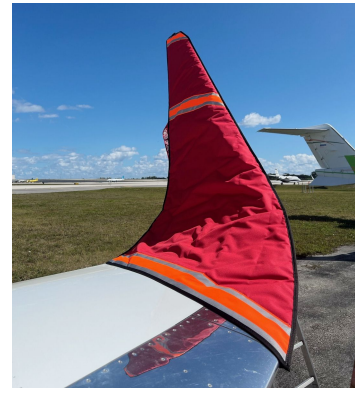
Falcon Jet 900 Winglet Padding Covers