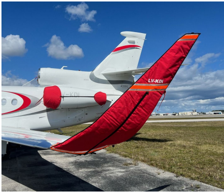
Falcon Jet 900 Winglet Padding Covers