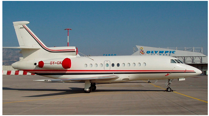
Falcon 900 Engine Covers