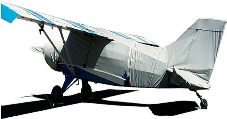
Maule Empennage, Engine & Prop Covers

WINTER USE MATERIAL - Made with Solution-Dyed Polyester fabric, this option is intended for seasonal use to aid in deicing, rain mitigation, or for occasional travel. The material is lighter and more compact, but more susceptible to UV damage and may have a shorter useful life if used continuously outside than the all-year use material.