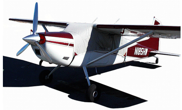
Cessna 185 Over-the-Top Canopy Cover