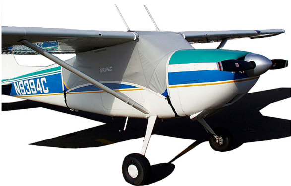
Cessna 180 Canopy Cover

This cover type is made from Silver Acrylic Sunbrella canvas and is 100% lined with a soft and smooth microfiber. Bruce's Custom Covers developed this material combination especially for aircraft protection. The outer material is medium weight and treated for water resistance, UV resistance and anti-static buildup. The inner lining is a very soft and smooth microfiber to prevent scratching. The material is very reflective, and tests show that the cabin interior temperature can be reduced to near-ambient temperature on the hottest of days. It is water, ice and snow repellent, yet breathable to allow moisture to escape from between the cover and the aircraft surface.