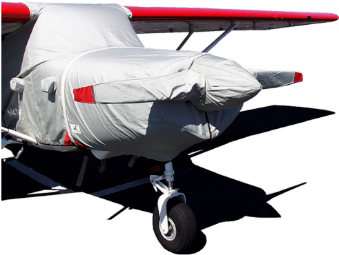
Maule Prop (2 Blade), Engine, & Canopy Cover

This cover type is made from Silver Acrylic Sunbrella canvas and is 100% lined with a soft and smooth microfiber. Bruce's Custom Covers developed this material combination especially for aircraft protection. The outer material is medium weight and treated for water resistance, UV resistance and anti-static buildup. The inner lining is a very soft and smooth microfiber to prevent scratching. The material is very reflective, and tests show that the cabin interior temperature can be reduced to near-ambient temperature on the hottest of days. It is water, ice and snow repellent, yet breathable to allow moisture to escape from between the cover and the aircraft surface.