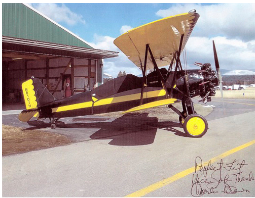
Stearman C3 Canopy Cover