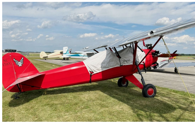
Davis D-1K Canopy Cover