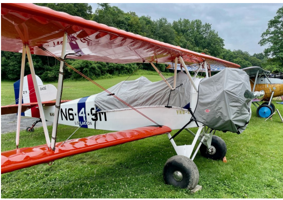
Fleet Biplane Model 1 Canopy & Engine Covers