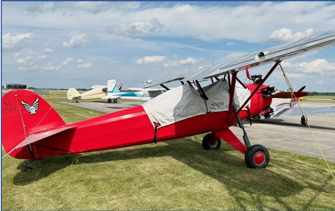
Davis D-1K Canopy Cover