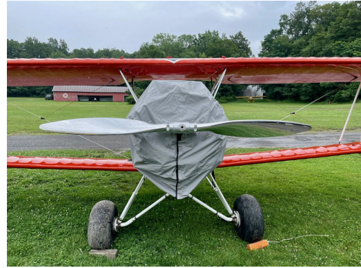
Fleet Biplane Model 1 Canopy & Engine Covers