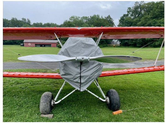
Fleet Biplane Model 1 Canopy & Engine Covers