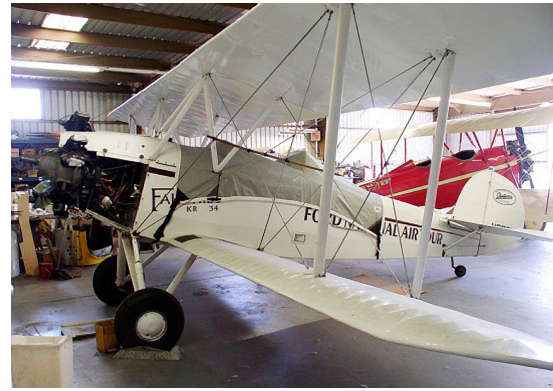
Fairchild KR-34 Canopy Cover