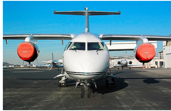
Fairchild /Dornier 328 Engine Covers