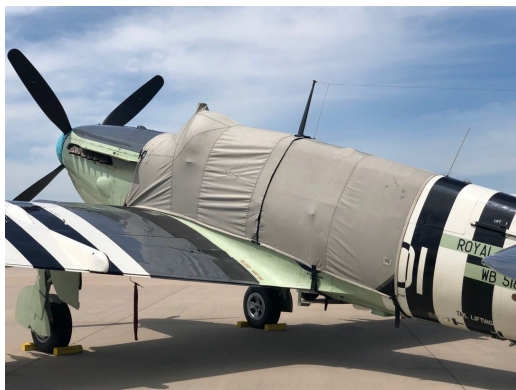
Fairey Firefly Canopy Cover