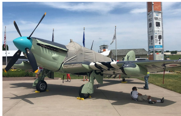
Fairey Firefly Canopy Cover