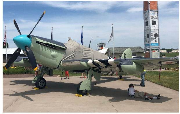
Fairey Firefly Canopy Cover