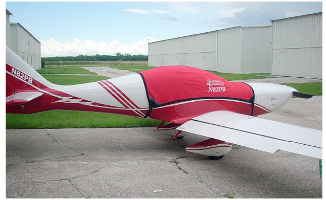
Lightning Canopy Cover