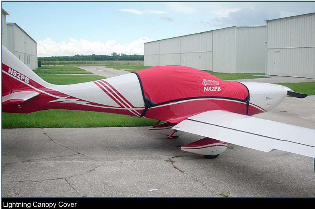
Lightning Canopy Cover