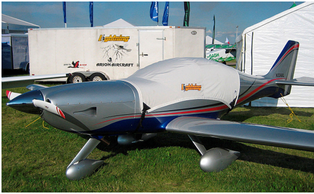
Lightning Canopy Cover