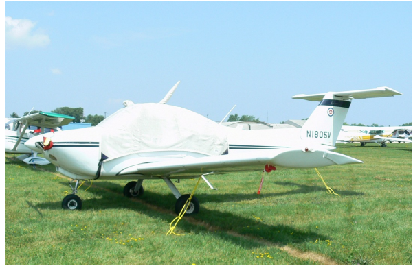
Beech Skipper Canopy Cover, Engine Plugs