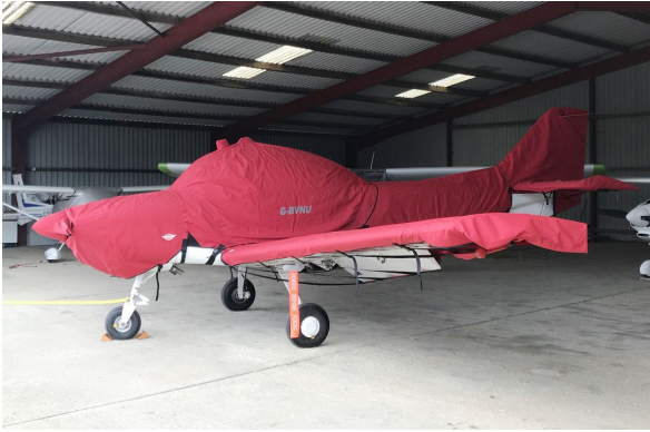
FLS Club Sprint Engine Cover

Covers developed this material combination especially for aircraft protection. The outer material is medium weight and treated for water resistance, UV resistance and anti-static buildup. The inner lining is a very soft and smooth microfiber to prevent scratching. The material is very reflective, and tests show that the cabin interior temperature can be reduced to near-ambient temperature on the hottest of days. It is water, ice and snow repellent, yet breathable to allow moisture to escape from between the cover and the aircraft surface.