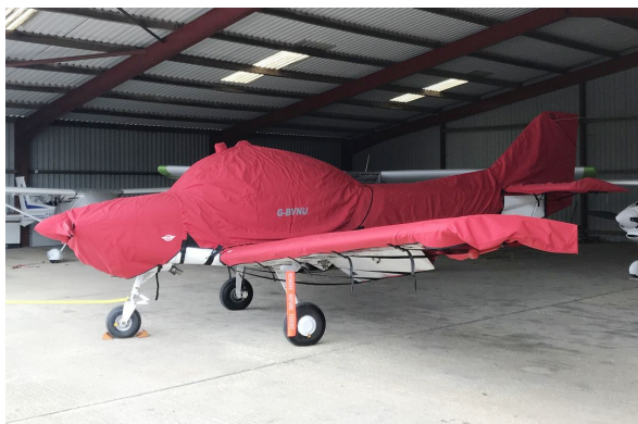
FLS Club Sprint Engine Cover

WINTER USE MATERIAL - Made with Solution-Dyed Polyester fabric, this option is intended for seasonal use to aid in deicing, rain mitigation, or for occasional travel. The material is lighter and more compact, but more susceptible to UV damage and may have a shorter useful life if used continuously outside than the all-year use material.