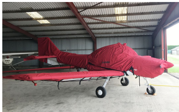
FLS Club Sprint Extended Canopy Cover