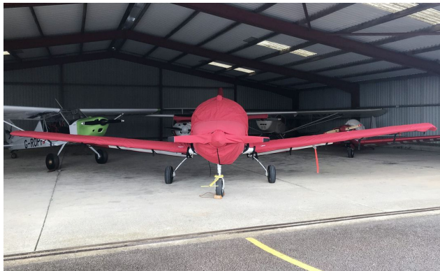
FLS Club Sprint Empennage Cover (Tailboom, Vertical & Horiz Stabilizers) All Year Use

WINTER USE MATERIAL - Made with Solution-Dyed Polyester fabric, this option is intended for seasonal use to aid in deicing, rain mitigation, or for occasional travel. The material is lighter and more compact, but more susceptible to UV damage and may have a shorter useful life if used continuously outside than the all-year use material.