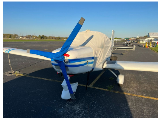
S C Aerostar Festival Prop Cover, Extended Canopy Cover