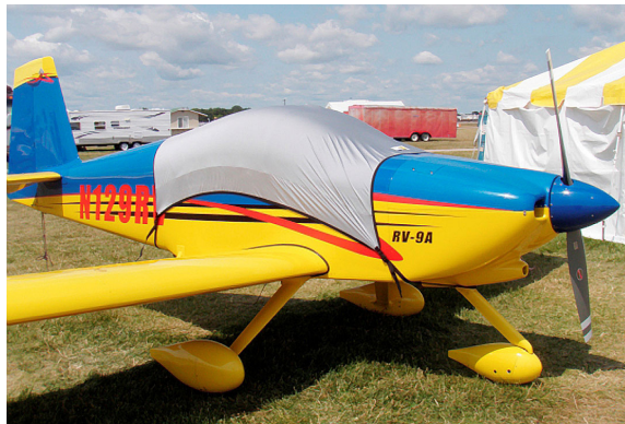
Van's RV-9A Light Weight Travel-Cover

Travel Covers are made with Silver Solution-Dyed Polyester fabric and only lined over the windshield to save weight. The material is lightweight and more compact for easy stowage in the aircraft. The polyester material is water resistant, but only intended for occasional use outside. We also have an ultra lightweight material available for fitted hangar dust covers. For daily outdoor use, the non-travel Sunbrella Cover is the best choice.