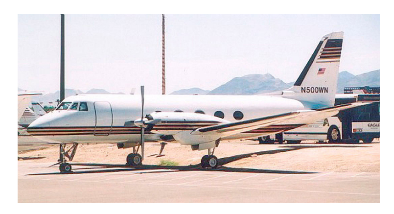
Covers, Plugs, HeatShields and related items for the Grumman Gulfstream I