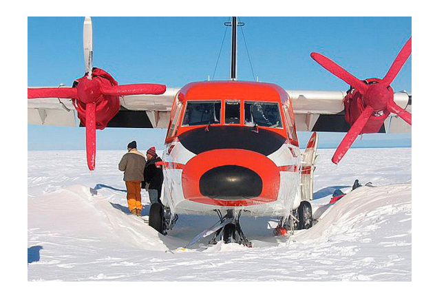
Casa 212 Insulated Engine & Propellor/Spinner Covers