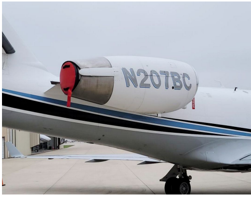
Gulfstream G100 Exhaust Plugs