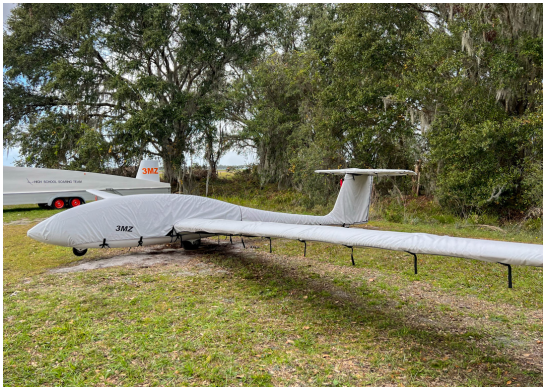
Burkhart Grob G 103 TWIN II Complete Cover Set

WINTER USE MATERIAL - Made with Solution-Dyed Polyester fabric, this option is intended for seasonal use to aid in deicing, rain mitigation, or for occasional travel. The material is lighter and more compact, but more susceptible to UV damage and may have a shorter useful life if used continuously outside than the all-year use material.