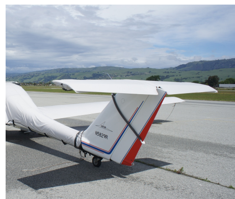
Grob 109 Horizontal Stabilizer Cover