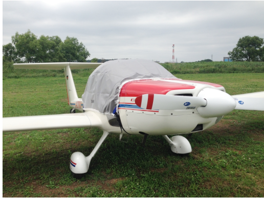
Grob 109 Travel Cover, Light Weight Travel Canopy Cover