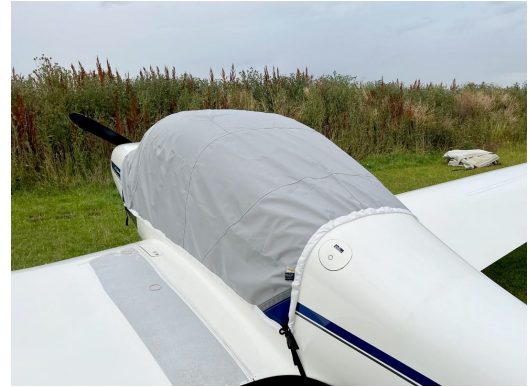
Grob 109 Travel Cover, Light Weight Canopy Cover