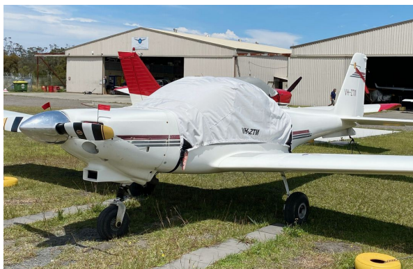
Grob 115 Canopy Cover

The Grob 115 Canopy/Engine Cover is a one-piece cover (100% lined with microfiber) that is a combination of the Canopy Cover and Engine Cover. This cover will enclose the engine cowl and will extend aft to cover all of the windows. This cover type is made from Silver Acrylic Sunbrella canvas and is 100% lined with a soft and smooth microfiber. Bruce's Custom Covers developed this material combination especially for aircraft protection. The outer material is medium weight and treated for water resistance, UV resistance and anti-static buildup. The inner lining is a very soft and smooth microfiber to prevent scratching. The material is very reflective, and tests show that the cabin interior temperature can be reduced to near-ambient temperature on the hottest of days. It is water, ice and snow repellent, yet breathable to allow moisture to escape from between the cover and the aircraft surface.