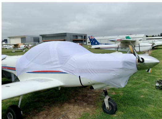
Grob 115 Canopy/Engine Cover, test fit cover

The Grob 115 Canopy/Engine Cover is a one-piece cover (100% lined with microfiber) that is a combination of the Canopy Cover and Engine Cover. This cover will enclose the engine cowl and will extend aft to cover all of the windows. This cover type is made from Silver Acrylic Sunbrella canvas and is 100% lined with a soft and smooth microfiber. Bruce's Custom Covers developed this material combination especially for aircraft protection. The outer material is medium weight and treated for water resistance, UV resistance and anti-static buildup. The inner lining is a very soft and smooth microfiber to prevent scratching. The material is very reflective, and tests show that the cabin interior temperature can be reduced to near-ambient temperature on the hottest of days. It is water, ice and snow repellent, yet breathable to allow moisture to escape from between the cover and the aircraft surface.