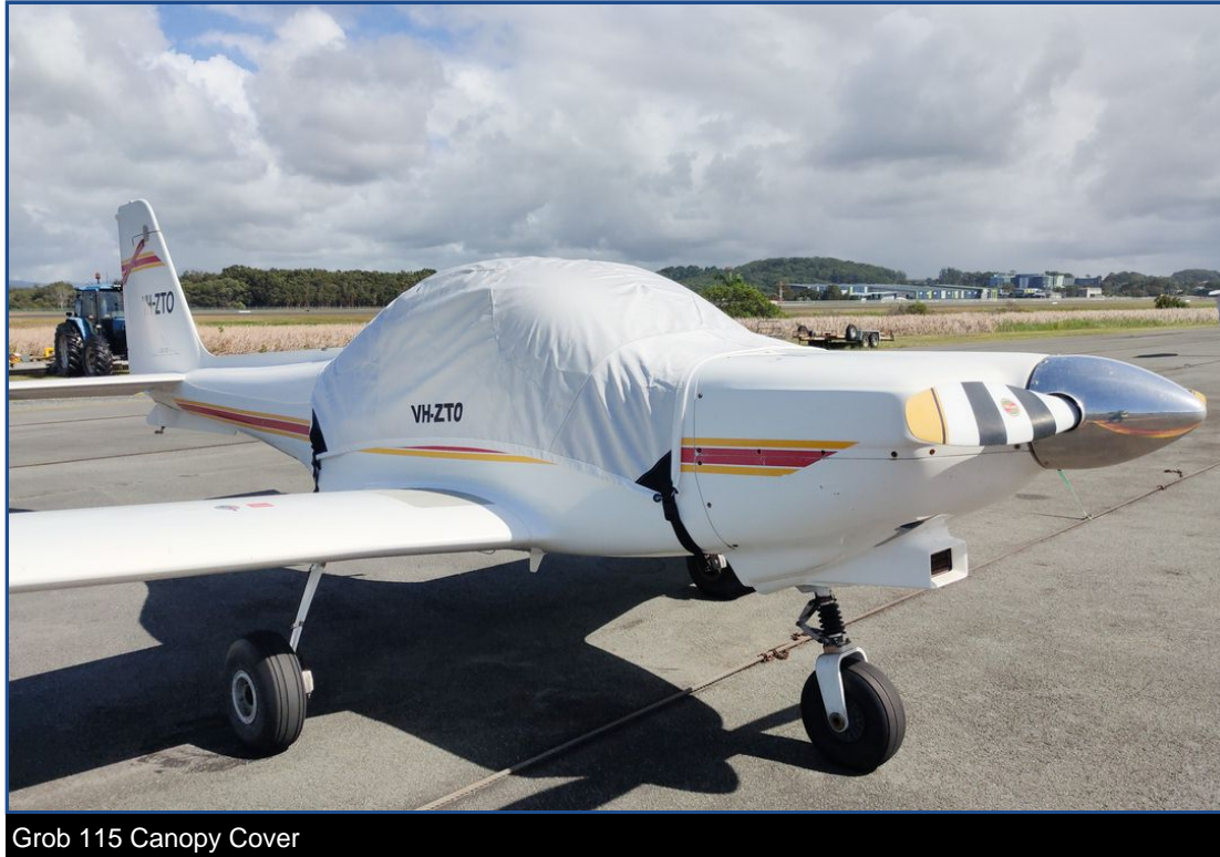
Grob 115 Canopy Cover