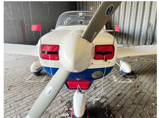
Grob 115 Engine Inlet Plugs, Incl. Carb. Inlet Plug