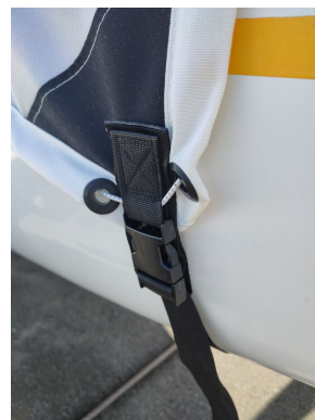
Grob 115 Canopy Cover, Buckle & Strap Detail