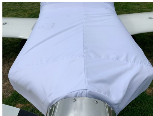
Grob 115 Canopy/Engine Cover, test fit cover