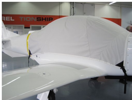
Grob 120TP Canopy Cover