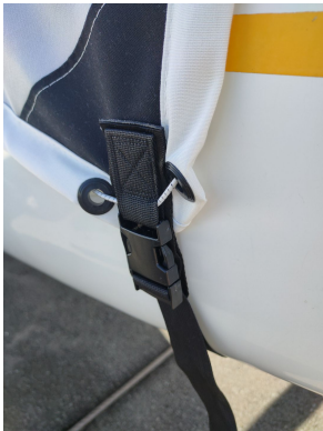
Grob 115 Canopy Cover, Buckle & Strap Detail

The Grob 115 Canopy/Engine Cover is a one-piece cover (100% lined with microfiber) that is a combination of the Canopy Cover and Engine Cover. This cover will enclose the engine cowl and will extend aft to cover all of the windows. This cover type is made from Silver Acrylic Sunbrella canvas and is 100% lined with a soft and smooth microfiber. Bruce's Custom Covers developed this material combination especially for aircraft protection. The outer material is medium weight and treated for water resistance, UV resistance and anti-static buildup. The inner lining is a very soft and smooth microfiber to prevent scratching. The material is very reflective, and tests show that the cabin interior temperature can be reduced to near-ambient temperature on the hottest of days. It is water, ice and snow repellent, yet breathable to allow moisture to escape from between the cover and the aircraft surface.