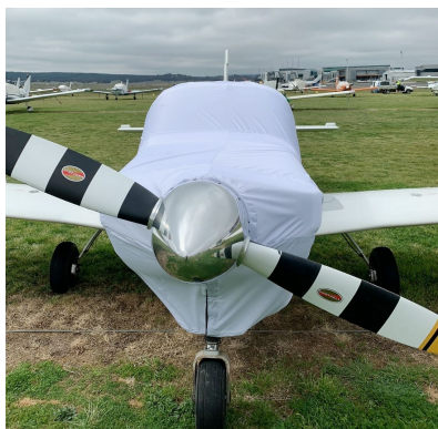
Grob 115 Canopy/Engine Cover, test fit cover

The Grob 115 Canopy/Engine Cover is a one-piece cover (100% lined with microfiber) that is a combination of the Canopy Cover and Engine Cover. This cover will enclose the engine cowl and will extend aft to cover all of the windows. This cover type is made from Silver Acrylic Sunbrella canvas and is 100% lined with a soft and smooth microfiber. Bruce's Custom Covers developed this material combination especially for aircraft protection. The outer material is medium weight and treated for water resistance, UV resistance and anti-static buildup. The inner lining is a very soft and smooth microfiber to prevent scratching. The material is very reflective, and tests show that the cabin interior temperature can be reduced to near-ambient temperature on the hottest of days. It is water, ice and snow repellent, yet breathable to allow moisture to escape from between the cover and the aircraft surface.