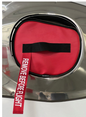
Gulfstream V APU Exhaust Plug

The Engine Inlet Plugs are custom fit for your Gulfstream Aerospace Gulfstream G150 intakes, made with heavy-duty vinyl material, and stuffed with a single block of sculpted urethane foam. Each plug has a zipper that allows the foam to be removed and dried if necessary. Engine plugs have 'remove before flight' streamers sewn onto the face of the plugs. Most plugs are imprinted with the aircraft registration number in black for an extra charge. Storage bag NOT included. Engine plugs may be inserted after flight when the engine is still warm. Engine Inlet Plugs are commonly referred to as Cowl Plugs, Intake Plugs, Cowl Blocks, Engine Blocks, and Engine Bunges.