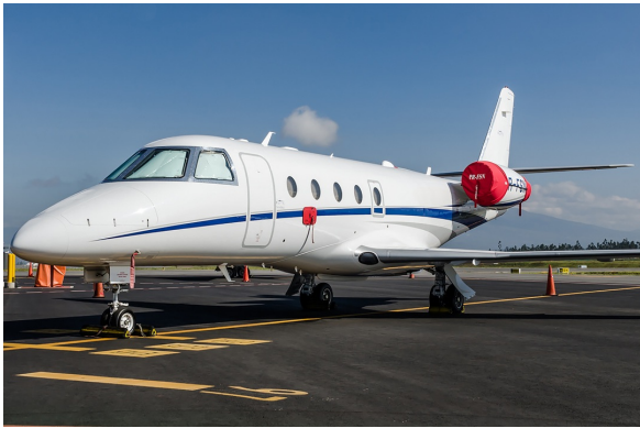
Gulfstream G150 Engine Covers, Cockpit HeatShields

Cockpit Heatshields are interior sunshades for the aircraft's cockpit. The product is a unique composite of closed-cell foam with a silver mylar finish. The semi-rigid design is stiff enough to stand inside the window framing. The set folds up flat and is easily stored in the included storage sleeve. Some designs may require velcro and suction cups. Our Heatshields for jets are offered white side out because some aircraft manufacturers have issued advisories against reflective window inserts due to potential heat damage. A Heatshield is an excellent short-term remedy for cockpit overheating, but an external fabric cover is more effective for long-term protection.