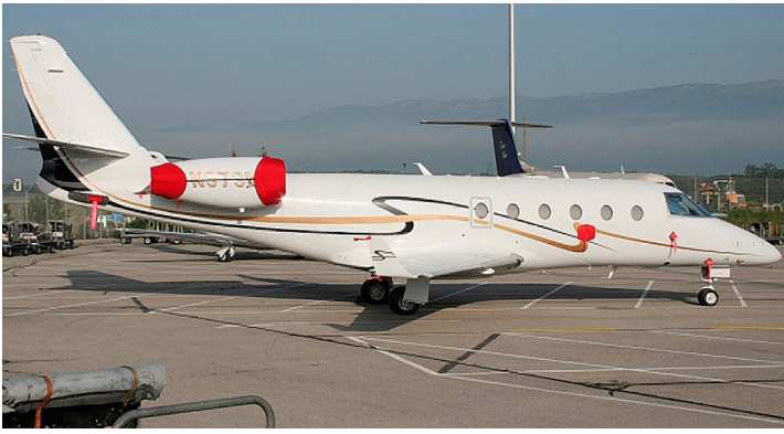
Engine Cover Set