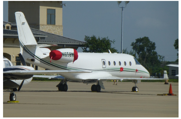
Gulfstream G150 Engine Cover Set