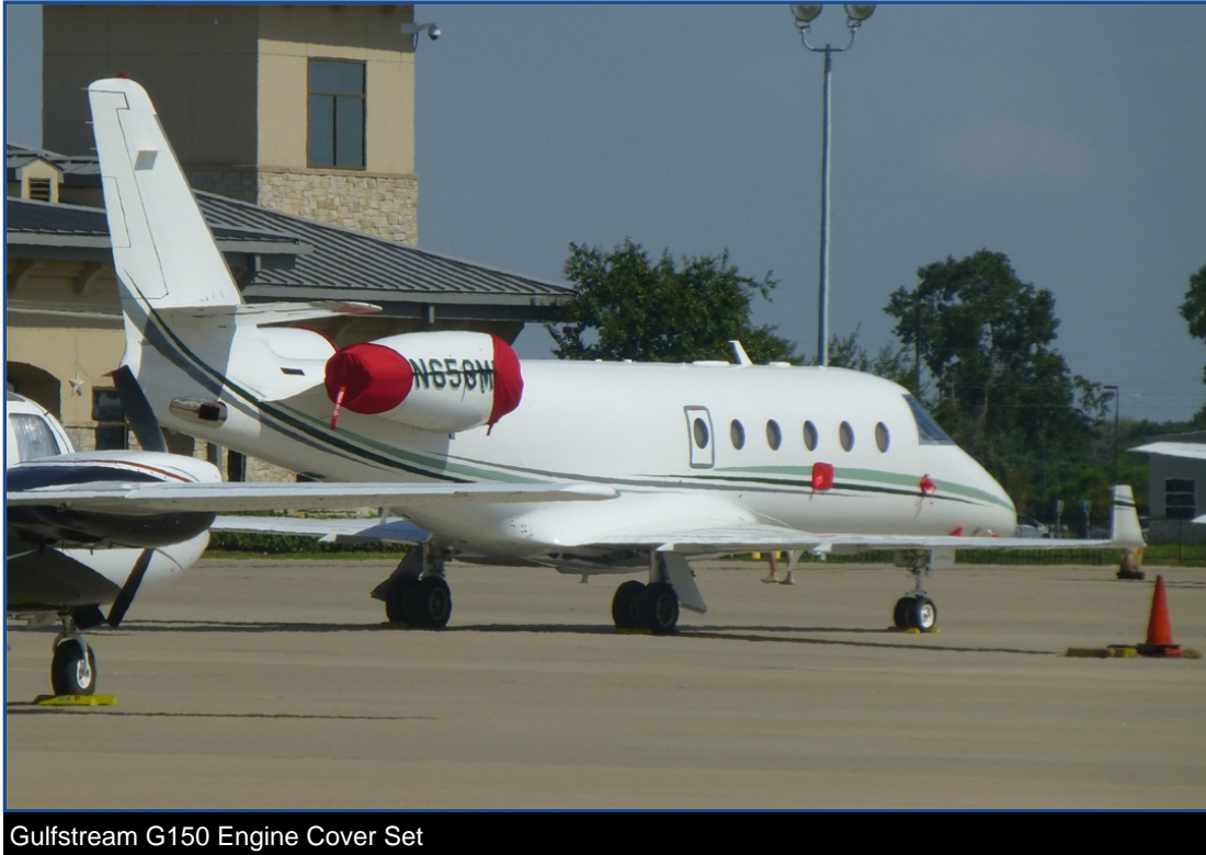
Gulfstream G150 Engine Cover Set