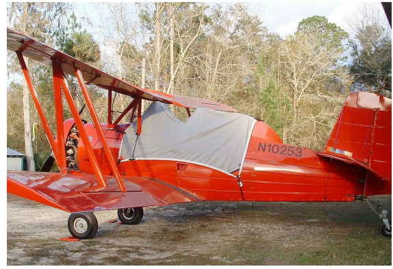
Grumman Ag Cat G-164, Open Cockpit, Canopy Cover