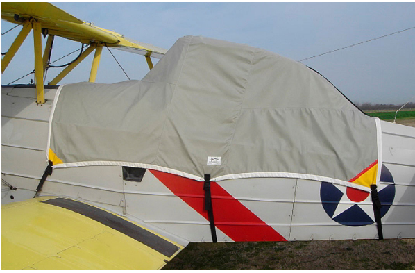
Grumman Ag-Cat Canopy Cover