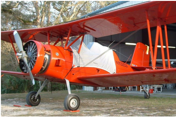
Grumman Ag Cat G-164, Open Cockpit, Canopy Cover