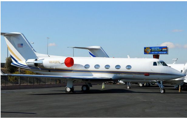
Grumman Gulfstream II Intake Covers

The Gulfstream Aerospace Gulfstream II, III (C-20D) Intake Covers are designed to install easily yet be completely storable. A spring steel hoop is sewn into the hem of each cover, allowing them to be installed without climbing onto the wing or using a stepladder. To store the covers the spring steel hoop folds like a band-saw blade into three nesting rings. Each cover folds into a compact circular bundle which is stored in the included duffle bag, yet they unfold quickly for use. The Tri-Fold Ring cover is made of medium weight nylon which is available in a variety of colors to match the paint trim. Each cover set comes complete with installation and folding instructions. The aircraft's registration number can be silkscreened onto the cover for an extra charge.