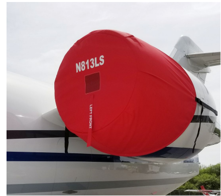
Grumman Gulfstream G-II Intake Covers