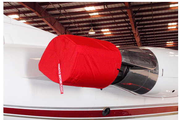
Stage III Quiet Technologies Hush Kit Cover