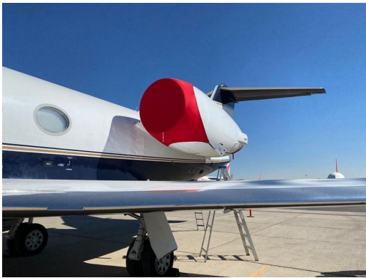
Grumman Gulfstream G-IV SP Engine Cover, bikini type

The Gulfstream Aerospace Gulfstream II, III (C-20D) Intake Covers are designed to install easily yet be completely storable. A spring steel hoop is sewn into the hem of each cover, allowing them to be installed without climbing onto the wing or using a stepladder. To store the covers the spring steel hoop folds like a band-saw blade into three nesting rings. Each cover folds into a compact circular bundle which is stored in the included duffle bag, yet they unfold quickly for use. The Tri-Fold Ring cover is made of medium weight nylon which is available in a variety of colors to match the paint trim. Each cover set comes complete with installation and folding instructions. The aircraft's registration number can be silkscreened onto the cover for an extra charge.