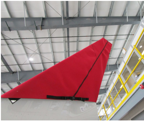
Bombardier Global Express Padded Winglet Covers