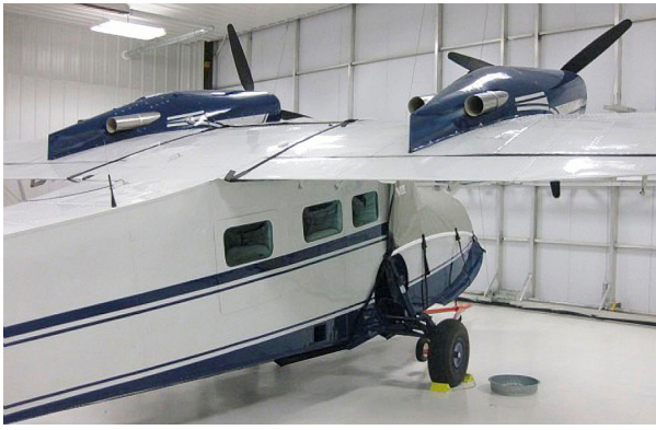
Grumman G44 Widgeon Cockpit/Nose Cover