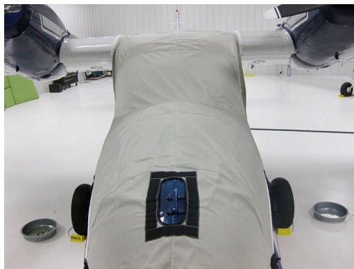
Grumman Widgeon Cockpit/Nose Cover, tie-down cleat detail