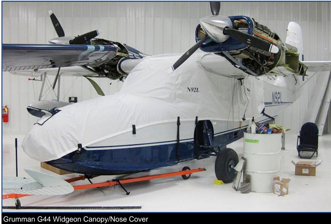
Grumman G44 Widgeon Canopy/Nose Cover