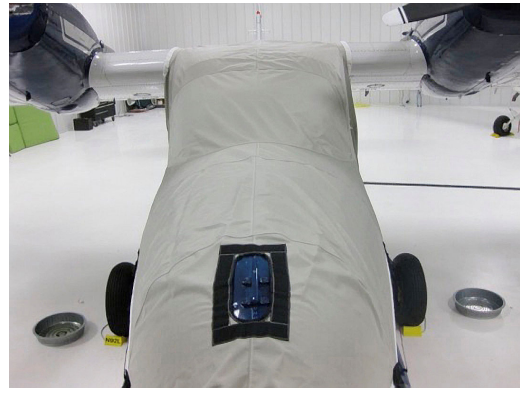
Grumman Widgeon Cockpit/Nose Cover, tie-down cleat detail