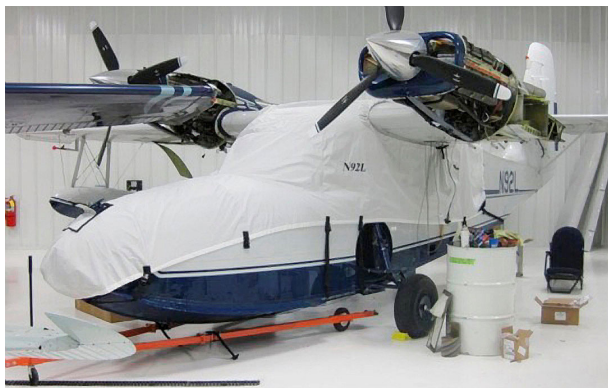
Grumman G44 Widgeon Canopy/Nose Cover