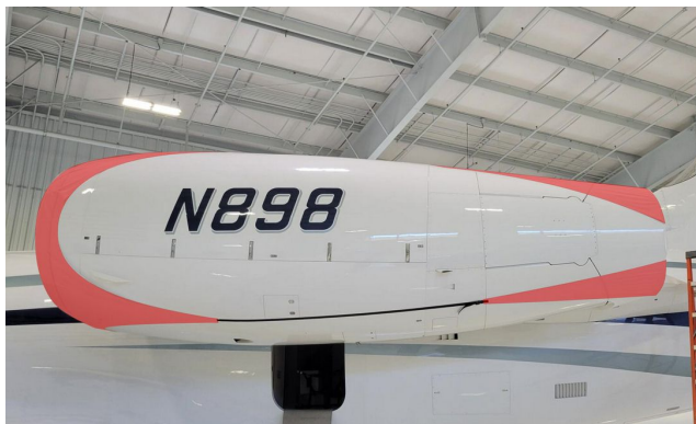
Gulfstream Aerospace G-IV (G350), Intake/Exhaust Cover, test fit cover

The Gulfstream Aerospace Gulfstream IV (C-20G), G350, G450 Intake Covers are designed to install easily yet be completely storable. A spring steel hoop is sewn into the hem of each cover, allowing them to be installed without climbing onto the wing or using a stepladder. To store the covers the spring steel hoop folds like a band-saw blade into three nesting rings. Each cover folds into a compact circular bundle which is stored in the included duffle bag, yet they unfold quickly for use. The Tri-Fold Ring cover is made of medium weight nylon which is available in a variety of colors to match the paint trim. Each cover set comes complete with installation and folding instructions. The aircraft's registration number can be silkscreened onto the cover for an extra charge.