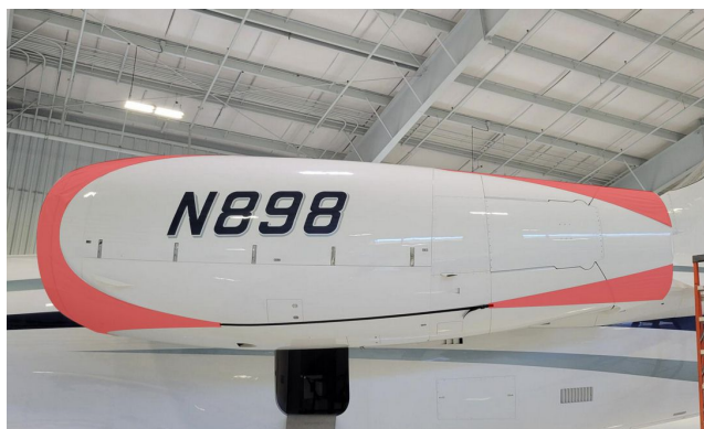
Gulfstream Aerospace G-IV (G350), Intake/Exhaust Cover, test fit cover

The Gulfstream Aerospace Gulfstream IV (C-20G), G350, G450 Intake Covers are designed to install easily yet be completely storable. A spring steel hoop is sewn into the hem of each cover, allowing them to be installed without climbing onto the wing or using a stepladder. To store the covers the spring steel hoop folds like a band-saw blade into three nesting rings. Each cover folds into a compact circular bundle which is stored in the included duffle bag, yet they unfold quickly for use. The Tri-Fold Ring cover is made of medium weight nylon which is available in a variety of colors to match the paint trim. Each cover set comes complete with installation and folding instructions. The aircraft's registration number can be silkscreened onto the cover for an extra charge.