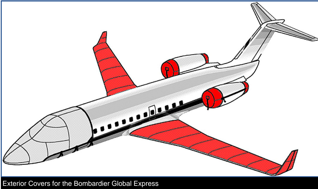
Exterior Covers for the Bombardier Global Express