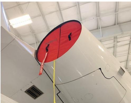
Grumman Gulfstream G-V Exhaust Plugs

The Engine Inlet Plugs are custom fit for your Gulfstream Aerospace Gulfstream IV (C-20G), G350, G450 intakes, made with heavy-duty vinyl material, and stuffed with a single block of sculpted urethane foam. Each plug has a zipper that allows the foam to be removed and dried if necessary. Engine plugs have 'remove before flight' streamers sewn onto the face of the plugs. Most plugs are imprinted with the aircraft registration number in black for an extra charge. Storage bag NOT included. Engine plugs may be inserted after flight when the engine is still warm. Engine Inlet Plugs are commonly referred to as Cowl Plugs, Intake Plugs, Cowl Blocks, Engine Blocks, and Engine Bunges.