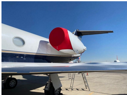
Grumman Gulfstream G-IV SP Engine Cover, bikini type

The Gulfstream Aerospace Gulfstream GVII (G400, G500, G600, G700, G800) Bikini Style Engine Covers are a single-piece design using a soft and smooth stretchy fabric. The cover stretches tightly over both the intake and exhaust, installing quickly and easily. These covers are designed to be used as hangar dust covers and have a useful life of approximately one year.