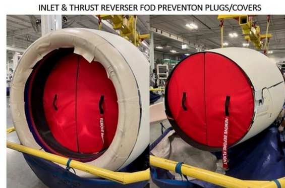
Gulfstream G500 FOD protection plugs for mfg process