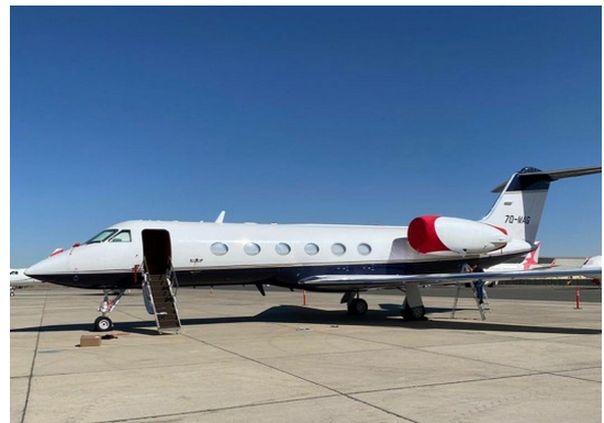
Grumman Gulfstream G-IV SP Engine Cover, bikini type