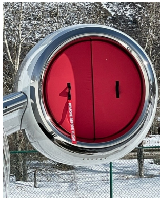
Gulfstream Aerospace Gulfstream GVII (G400,