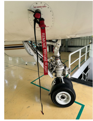
G400 TAT/ID Covers