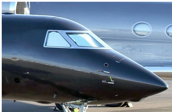
Gulfstream Cockpit Heatshields