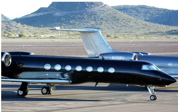
Gulfstream Cockpit Heatshields

Cockpit Heatshields are interior sunshades for the aircraft's cockpit. The product is a unique composite of closed-cell foam with a silver mylar finish. The semi-rigid design is stiff enough to stand inside the window framing. The set folds up flat and is easily stored in the included storage sleeve. Some designs may require velcro and suction cups. Our Heatshields for jets are offered white side out because some aircraft manufacturers have issued advisories against reflective window inserts due to potential heat damage. A Heatshield is an excellent short-term remedy for cockpit overheating, but an external fabric cover is more effective for long-term protection.