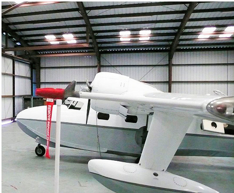
Grumman Mallard Pitot Cover with Install Tool