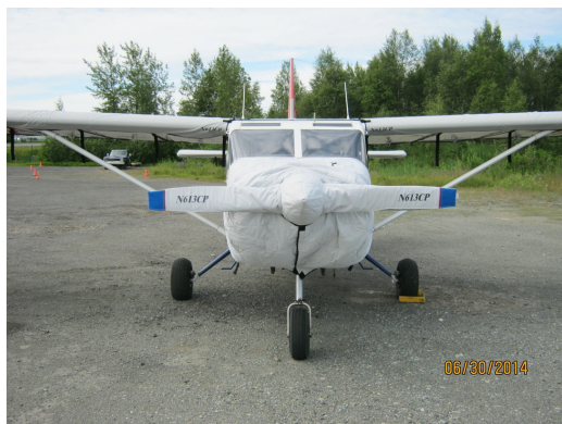
Gippsland GA-8 Airvan Insulated Engine and Prop Covers

This cover type is made from Silver Acrylic Sunbrella canvas and is 100% lined with a soft and smooth microfiber. Bruce's Custom Covers developed this material combination especially for aircraft protection. The outer material is medium weight and treated for water resistance, UV resistance and anti-static buildup. The inner lining is a very soft and smooth microfiber to prevent scratching. The material is very reflective, and tests show that the cabin interior temperature can be reduced to near-ambient temperature on the hottest of days. It is water, ice and snow repellent, yet breathable to allow moisture to escape from between the cover and the aircraft surface.