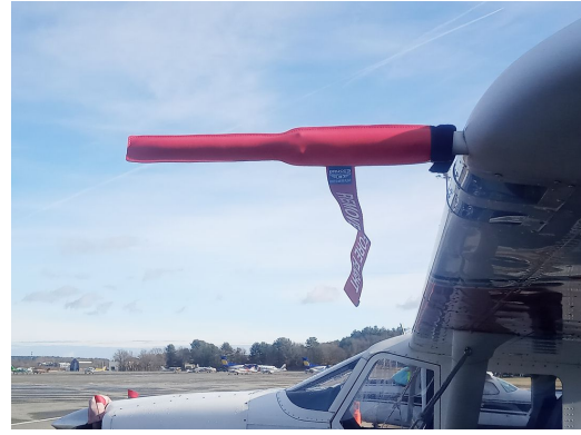
Gippsland GA-8 Airvan Pitot Cover