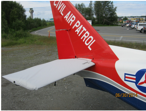
Gippsland GA-8 Airvan Horizontal Stab. Cover

shorter useful life if used continuously outside than the all-year use material.