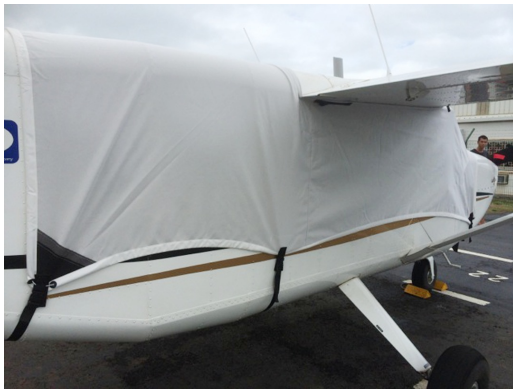
Gippsland GA-8 Airvan Canopy Cover

This cover type is made from Silver Acrylic Sunbrella canvas and is 100% lined with a soft and smooth microfiber. Bruce's Custom Covers developed this material combination especially for aircraft protection. The outer material is medium weight and treated for water resistance, UV resistance and anti-static buildup. The inner lining is a very soft and smooth microfiber to prevent scratching. The material is very reflective, and tests show that the cabin interior temperature can be reduced to near-ambient temperature on the hottest of days. It is water, ice and snow repellent, yet breathable to allow moisture to escape from between the cover and the aircraft surface.