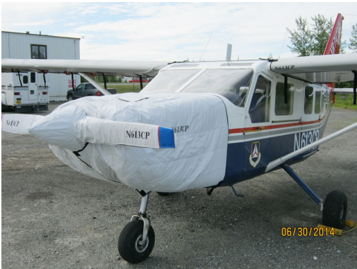
Gippsland GA-8 Airvan Insulated Engine and Prop Covers

This cover type is made from Silver Acrylic Sunbrella canvas and is 100% lined with a soft and smooth microfiber. Bruce's Custom Covers developed this material combination especially for aircraft protection. The outer material is medium weight and treated for water resistance, UV resistance and anti-static buildup. The inner lining is a very soft and smooth microfiber to prevent scratching. The material is very reflective, and tests show that the cabin interior temperature can be reduced to near-ambient temperature on the hottest of days. It is water, ice and snow repellent, yet breathable to allow moisture to escape from between the cover and the aircraft surface.