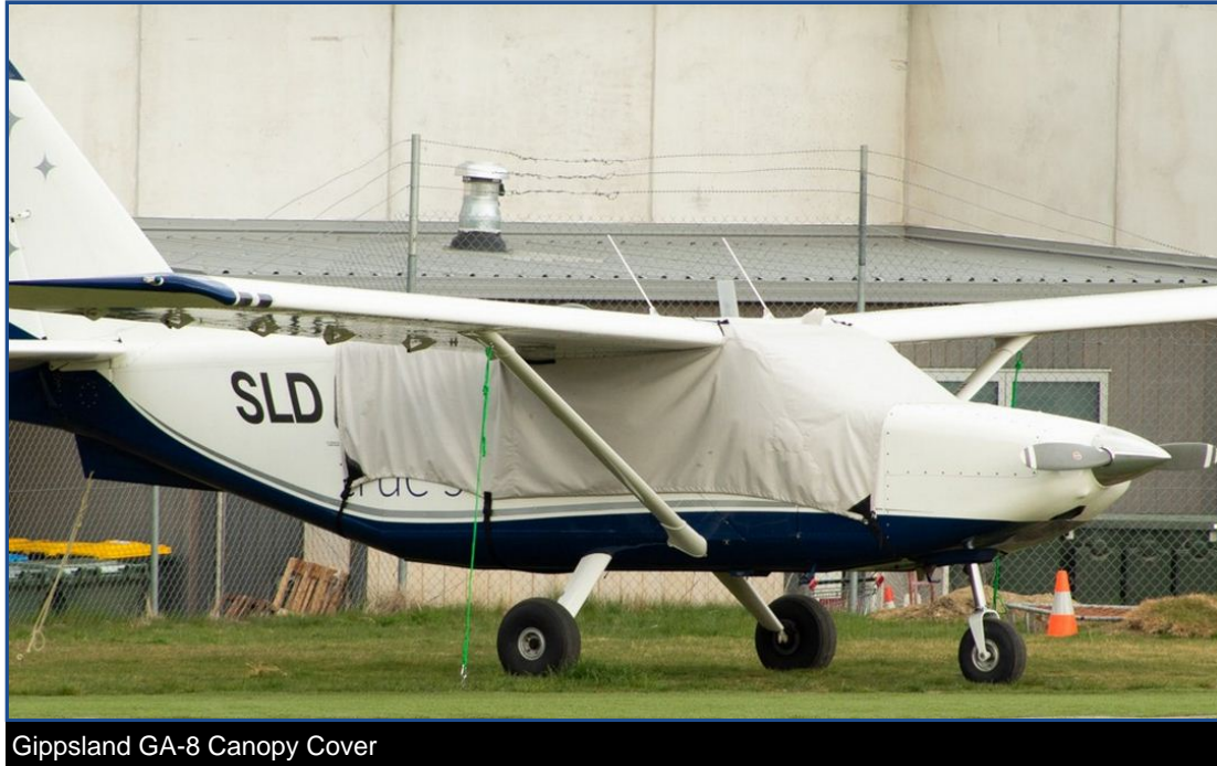
Gippsland GA-8 Canopy Cover