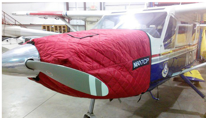
GA-8 Insulated Engine Cover