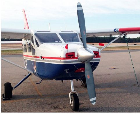
GA-8 Engine Inlet Plugs (set of 3)