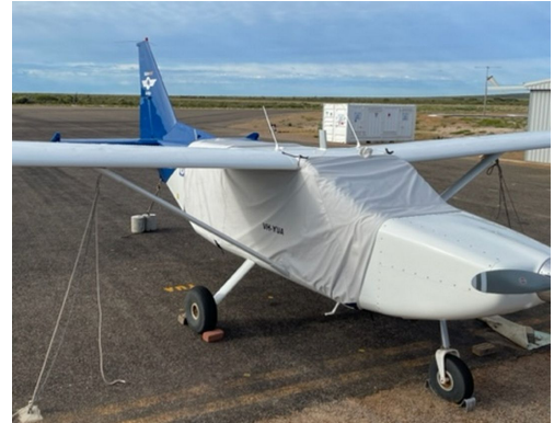
Gippsland GA-8 Extended Canopy Cover