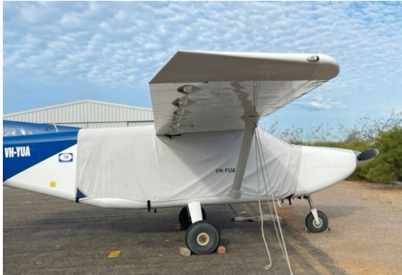
Gippsland GA-8 Extended Canopy Cover

This cover type is made from Silver Acrylic Sunbrella canvas and is 100% lined with a soft and smooth microfiber. Bruce's Custom Covers developed this material combination especially for aircraft protection. The outer material is medium weight and treated for water resistance, UV resistance and anti-static buildup. The inner lining is a very soft and smooth microfiber to prevent scratching. The material is very reflective, and tests show that the cabin interior temperature can be reduced to near-ambient temperature on the hottest of days. It is water, ice and snow repellent, yet breathable to allow moisture to escape from between the cover and the aircraft surface.