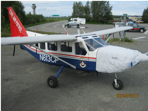
Gippsland GA-8 Airvan Insulated Engine, Wing and Prop Covers