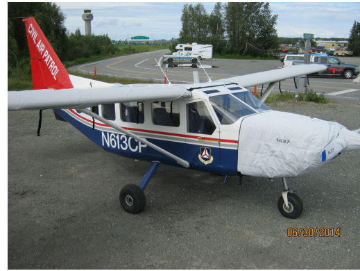
Gippsland GA-8 Airvan Insulated Engine, Wing and Prop Covers