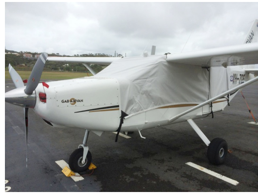
Gippsland GA-8 Airvan Canopy Cover