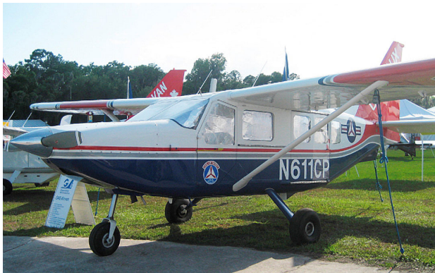
Gippsland GA-8 Airvan Cockpit & Cabin HeatShield Set

Cockpit Heatshields are interior sunshades for the aircraft's cockpit. The product is a unique composite of closed-cell foam with a silver mylar finish. The semi-rigid design is stiff enough to stand inside the window framing. The set folds up flat and is easily stored in the included storage sleeve. Some designs may require velcro and suction cups. A Heatshield is an excellent short-term remedy for cockpit overheating, but an external fabric cover is more effective for long-term protection.