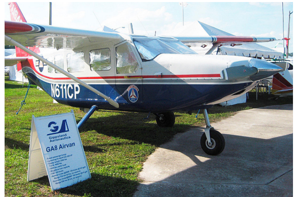
Gippsland GA-8 Airvan Cockpit & Cabin HeatShield Set