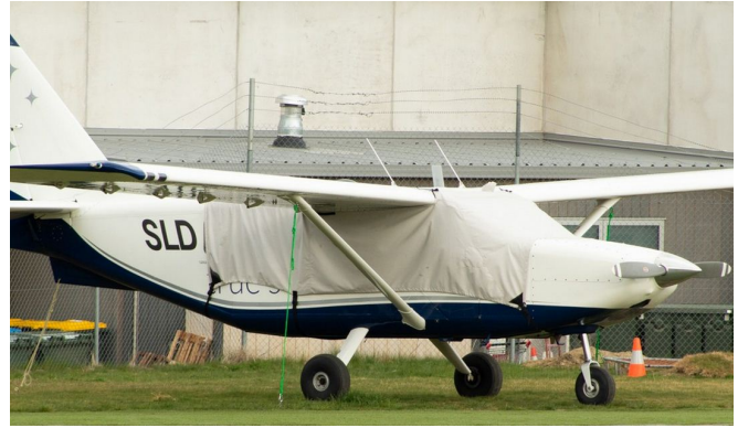
Gippsland GA-8 Canopy Cover