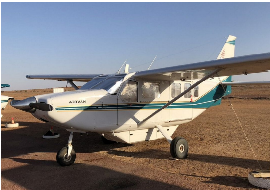
Gippsland GA-8 Airvan

Cockpit Heatshields are interior sunshades for the aircraft's cockpit. The product is a unique composite of closed-cell foam with a silver mylar finish. The semi-rigid design is stiff enough to stand inside the window framing. The set folds up flat and is easily stored in the included storage sleeve. Some designs may require velcro and suction cups. A Heatshield is an excellent short-term remedy for cockpit overheating, but an external fabric cover is more effective for long-term protection.