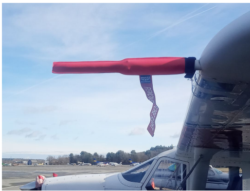
Gippsland GA-8 Airvan Pitot Cover