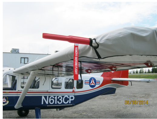
Gippsland GA-8 Airvan Wing Covers, Pitot Cover