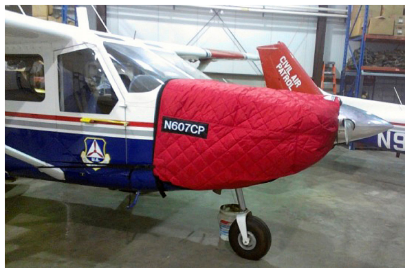
GA-8 Insulated Engine Cover

This cover type is made from Silver Acrylic Sunbrella canvas and is 100% lined with a soft and smooth microfiber. Bruce's Custom Covers developed this material combination especially for aircraft protection. The outer material is medium weight and treated for water resistance, UV resistance and anti-static buildup. The inner lining is a very soft and smooth microfiber to prevent scratching. The material is very reflective, and tests show that the cabin interior temperature can be reduced to near-ambient temperature on the hottest of days. It is water, ice and snow repellent, yet breathable to allow moisture to escape from between the cover and the aircraft surface.