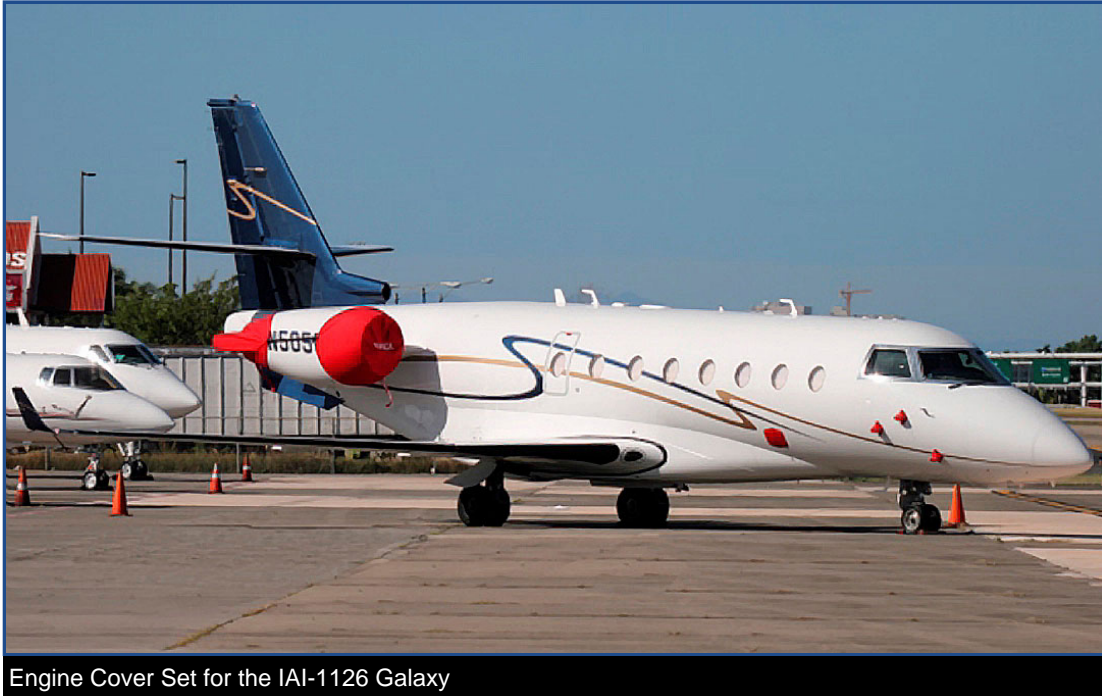
Engine Cover Set for the IAI-1126 Galaxy