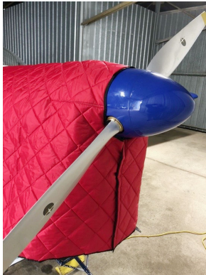
Zlin 142 Insulated Hangar Blanket

This cover type is made from Silver Acrylic Sunbrella canvas and is 100% lined with a soft and smooth microfiber. Bruce's Custom Covers developed this material combination especially for aircraft protection. The outer material is medium weight and treated for water resistance, UV resistance and anti-static buildup. The inner lining is a very soft and smooth microfiber to prevent scratching. The material is very reflective, and tests show that the cabin interior temperature can be reduced to near-ambient temperature on the hottest of days. It is water, ice and snow repellent, yet breathable to allow moisture to escape from between the cover and the aircraft surface.