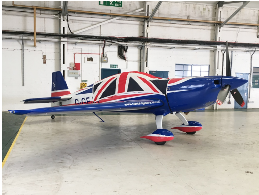
Extra 330 Canopy Cover, custom design

This cover type is made from Silver Acrylic Sunbrella canvas and is 100% lined with a soft and smooth microfiber. Bruce's Custom Covers developed this material combination especially for aircraft protection. The outer material is medium weight and treated for water resistance, UV resistance and anti-static buildup. The inner lining is a very soft and smooth microfiber to prevent scratching. The material is very reflective, and tests show that the cabin interior temperature can be reduced to near-ambient temperature on the hottest of days. It is water, ice and snow repellent, yet breathable to allow moisture to escape from between the cover and the aircraft surface.