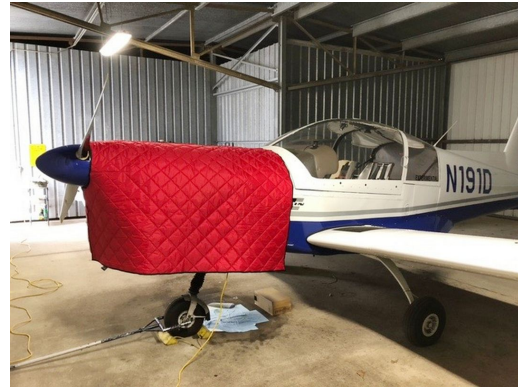
Zlin 142 Insulated Hangar Blanket