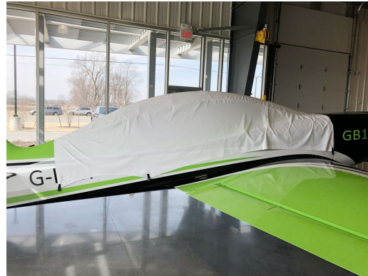
Game Composites GB-1 Canopy Cover, test fit cover