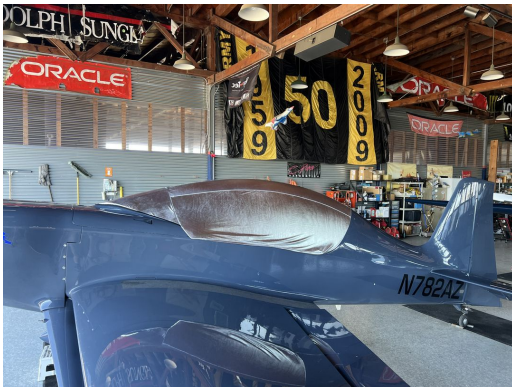
Gamebird GB-1, tandem configuration, Solar Cap

Travel Covers are made with Silver Solution-Dyed Polyester fabric and only lined over the windshield to save weight. The material is lightweight and more compact for easy stowage in the aircraft. The polyester material is water resistant, but only intended for occasional use outside. We also have an ultra lightweight material available for fitted hangar dust covers. For daily outdoor use, the non-travel Sunbrella Cover is the best choice.