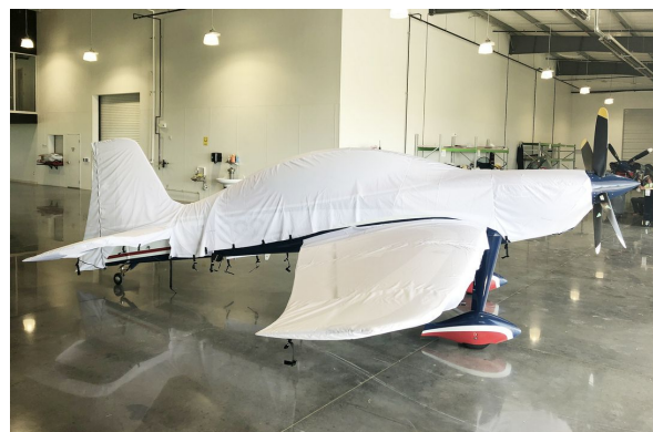
Gamebird GB-1 Extended Canopy/Engine, Wing & Empennage Covers (test fit covers)