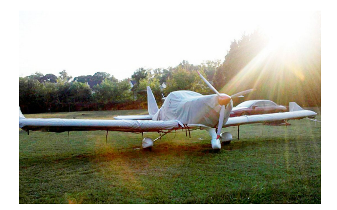
Gobosh Full Cover Set