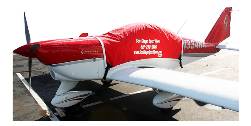
Gobosh Canopy Cover with custom Imprint

This cover type is made from Silver Acrylic Sunbrella canvas and is 100% lined with a soft and smooth microfiber. Bruce's Custom Covers developed this material combination especially for aircraft protection. The outer material is medium weight and treated for water resistance, UV resistance and anti-static buildup. The inner lining is a very soft and smooth microfiber to prevent scratching. The material is very reflective, and tests show that the cabin interior temperature can be reduced to near-ambient temperature on the hottest of days. It is water, ice and snow repellent, yet breathable to allow moisture to escape from between the cover and the aircraft surface.