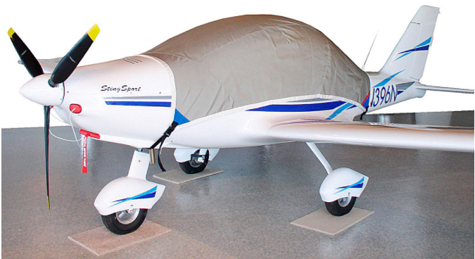
Sting Sport Canopy Cover & Engine Plugs