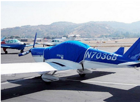
Gobosh 700S Canopy Cover (comes in colors)

This cover type is made from Silver Acrylic Sunbrella canvas and is 100% lined with a soft and smooth microfiber. Bruce's Custom Covers developed this material combination especially for aircraft protection. The outer material is medium weight and treated for water resistance, UV resistance and anti-static buildup. The inner lining is a very soft and smooth microfiber to prevent scratching. The material is very reflective, and tests show that the cabin interior temperature can be reduced to near-ambient temperature on the hottest of days. It is water, ice and snow repellent, yet breathable to allow moisture to escape from between the cover and the aircraft surface.