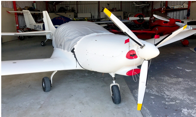
Gobosh 800XP Travel Cover, Light Weight Travel Canopy Cover Gobosh 800XP Travel Cover, Light Weight Travel Canopy Cover and Inlet Plugs