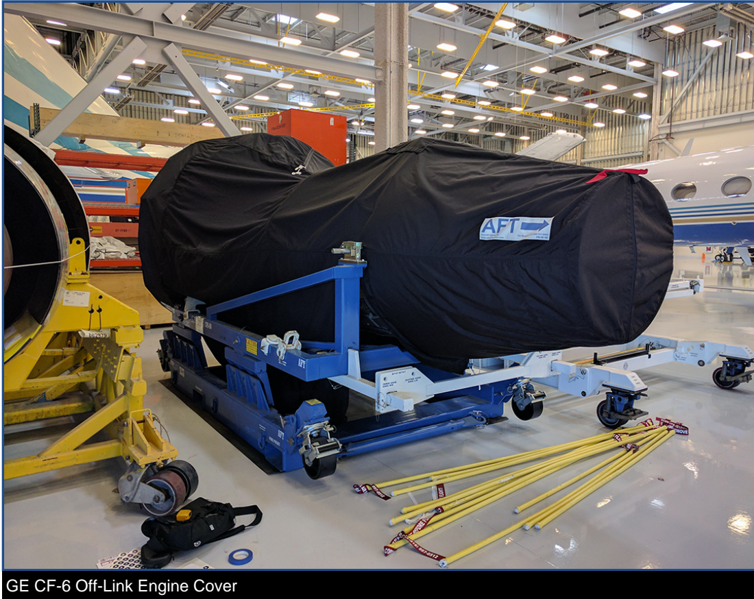
GE CF-6 Off-Link Engine Cover