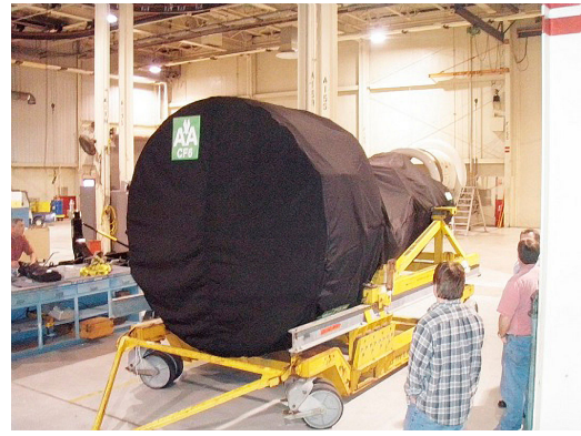
GE CF-6 QEC Engine Long-term Storage/Transport Cover "Bag" (Boeing 767)