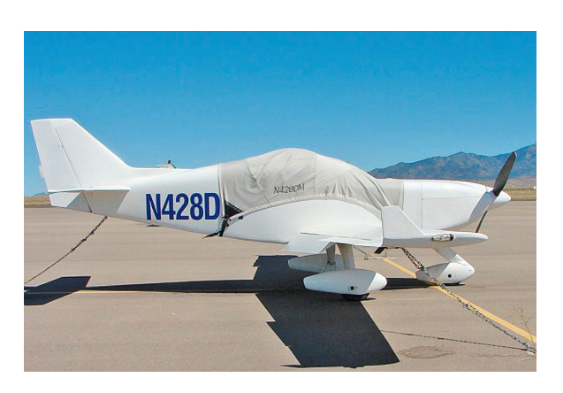
Glasair I Canopy Cover