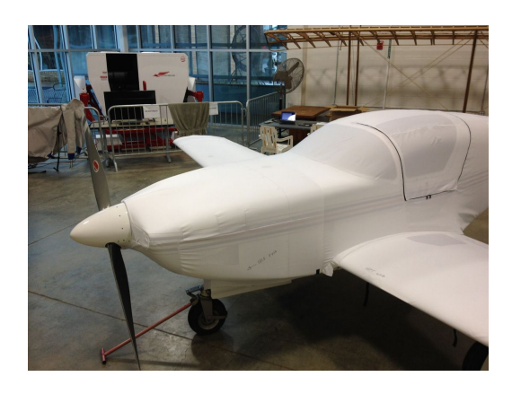
Glasair Aviation Glasair I Complete Fuselage Cover W/Detachable Wing Covers

This cover type is made from Silver Acrylic Sunbrella canvas and is 100% lined with a soft and smooth microfiber. Bruce's Custom Covers developed this material combination especially for aircraft protection. The outer material is medium weight and treated for water resistance, UV resistance and anti-static buildup. The inner lining is a very soft and smooth microfiber to prevent scratching. The material is very reflective, and tests show that the cabin interior temperature can be reduced to near-ambient temperature on the hottest of days. It is water, ice and snow repellent, yet breathable to allow moisture to escape from between the cover and the aircraft surface.