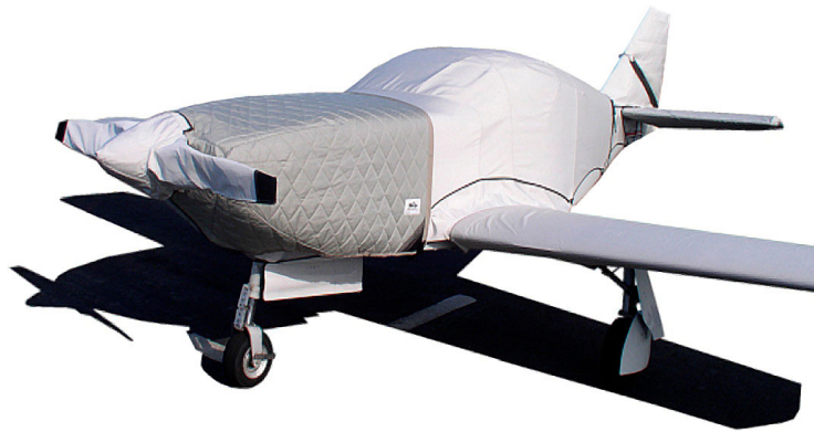
Glasair I Insulated Engine Cover, Prop Cover, Etc.

WINTER USE MATERIAL - Made with Solution-Dyed Polyester fabric, this option is intended for seasonal use to aid in deicing, rain mitigation, or for occasional travel. The material is lighter and more compact, but more susceptible to UV damage and may have a shorter useful life if used continuously outside than the all-year use material.