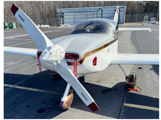
Glasair II 2-Blade Prop Cover