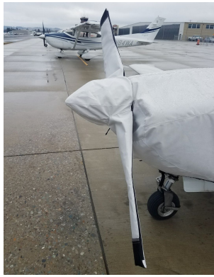
Glasair Aviation Glasair II & III Propellor/Spinner Cover, 2 Blade