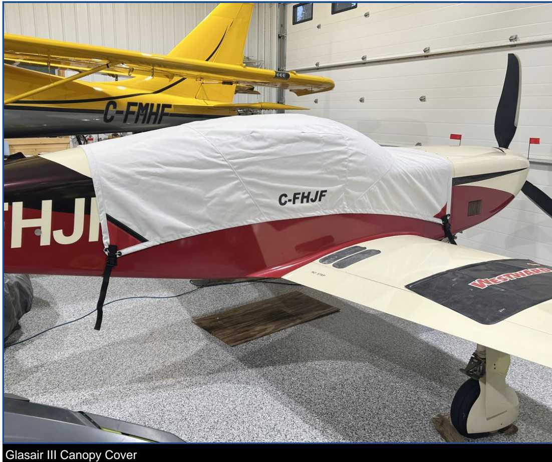
Glasair III Canopy Cover