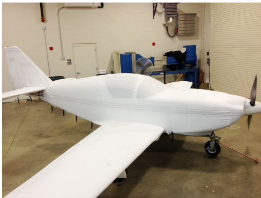
Glasair 2 Complete Fuselage/Wings Cover, test fit cover

This cover type is made from Silver Acrylic Sunbrella canvas and is 100% lined with a soft and smooth microfiber. Bruce's Custom Covers developed this material combination especially for aircraft protection. The outer material is medium weight and treated for water resistance, UV resistance and anti-static buildup. The inner lining is a very soft and smooth microfiber to prevent scratching. The material is very reflective, and tests show that the cabin interior temperature can be reduced to near-ambient temperature on the hottest of days. It is water, ice and snow repellent, yet breathable to allow moisture to escape from between the cover and the aircraft surface.