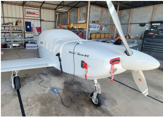
GLASAIR S2-RG Canopy Cover, Engine Plugs