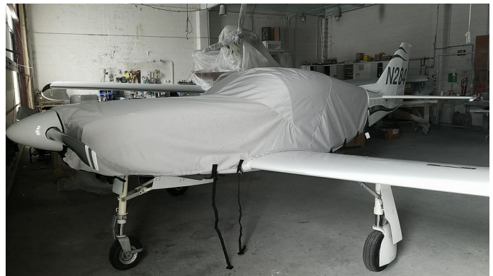
Glasair III Extended Canopy/Engine Cover