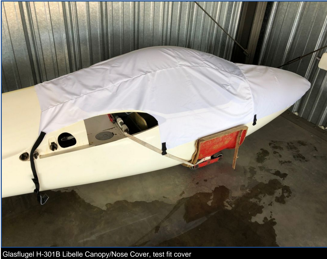
Glasflugel H-301B Libelle Canopy/Nose Cover, test fit cover