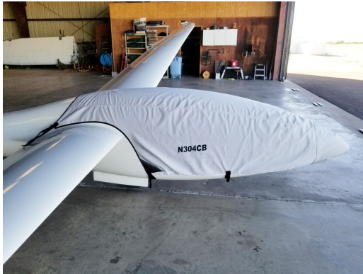
GLASFLUGEL 304C Canopy/Nose Cover

water resistance, UV resistance and anti-static buildup. The inner lining is a very soft and smooth microfiber to prevent scratching. The material is very reflective, and tests show that the cabin interior temperature can be reduced to near-ambient temperature on the hottest of days. It is water, ice and snow repellent, yet breathable to allow moisture to escape from between the cover and the aircraft surface.