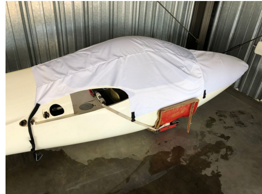
Sailplane Full Cover Set Graphic Indicators (Discus 2B, 3D model) Glasflugel H-301B Libelle Canopy/Nose Cover, test fit cover