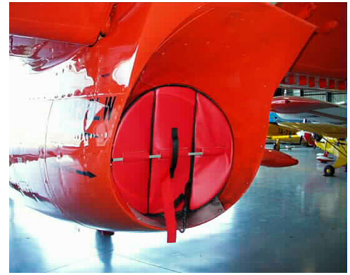
Exhaust Plug, folding type