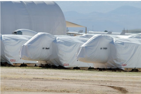
GR-7/9 FULL FUSELAGE COVER , NSN's: 1730-01-600-4557 GR-7/9 FULL FUSELAGE COVER , NSN's: 1730-01-600-4557 & 1730-01-600-6757, single seat