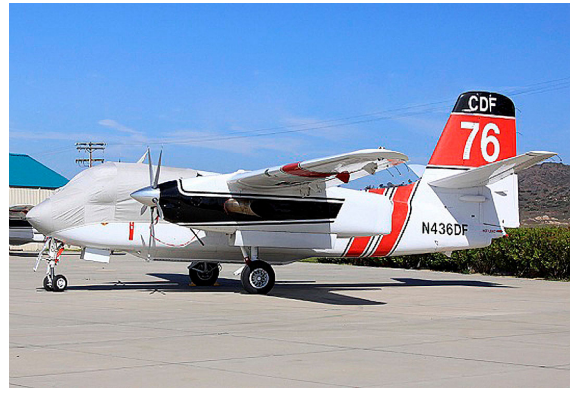
Grumman Tracker (turbine model) Canopy/Nose Cover