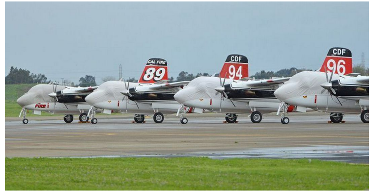
Grumman S2 Tracker Canopy/Nose Covers