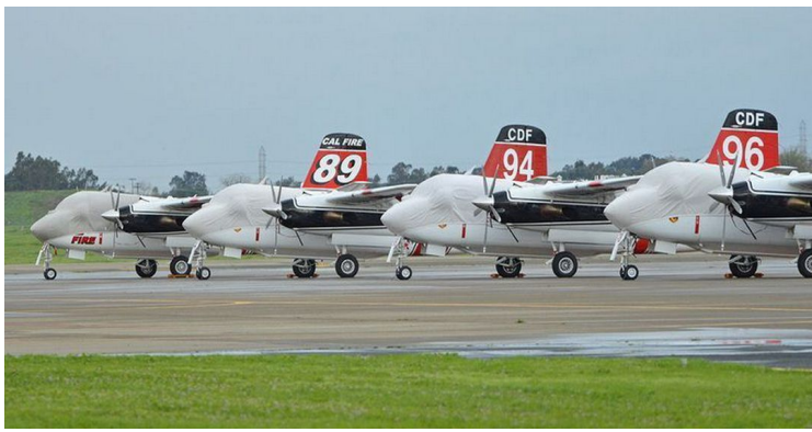
Grumman S2 Tracker Canopy/Nose Covers