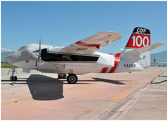
Grumman Tracker (turbine model) Canopy/Nose Cover