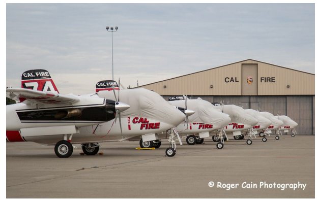
Grumman S-2 Tracker Canopy/Nose Cover