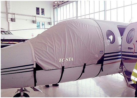
Beechjet 400A Cockpit Cover