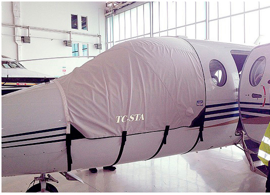
Beechjet 400A Cockpit Cover