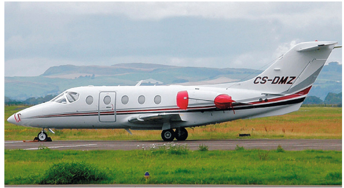
Beechjet 400 Engine & Pitot Covers