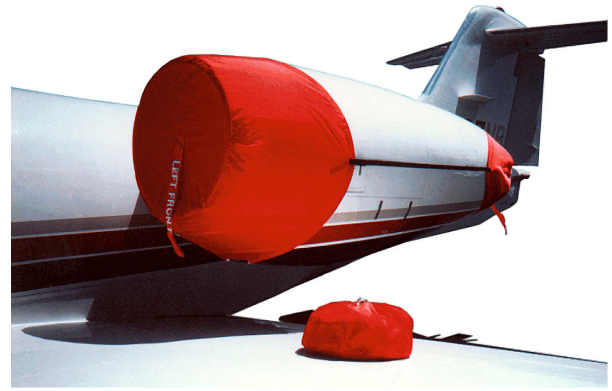
Lear 35 Engine Covers