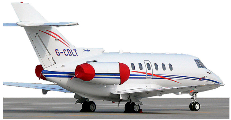
Hawker 800 Tri-Fold Engine Covers